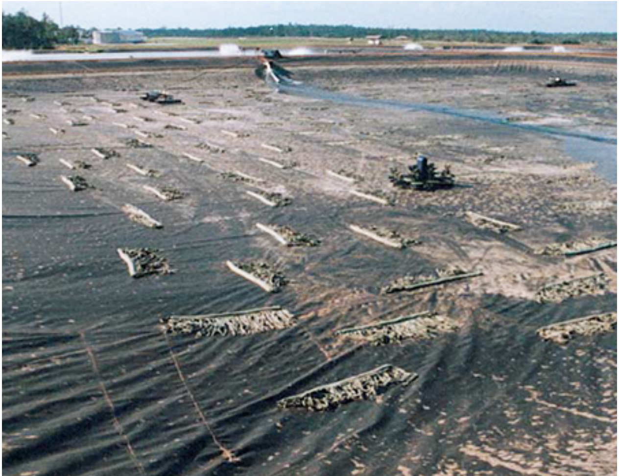
Recently harvested shrimp pond at Belize Aquaculture, Ltd. showing placement of AquaMats®.

Aquaculture, Ltd. provides a good example of what can be achieved by the deployment of AquaMats® in a well-managed ZEAH system. Last fall, Belize Aquaculture performed a direct comparison between ZEAH practices with and without AquaMats®. AquaMats® were deployed at 1,100 square meters per hectare, and stocking densities of 73 PL per cubic meter were utilized in a 139-day growing season. Ponds with AquaMats® produced 24,951 kilograms per hectare, while control ponds produced 19,395 kilograms per hectare.