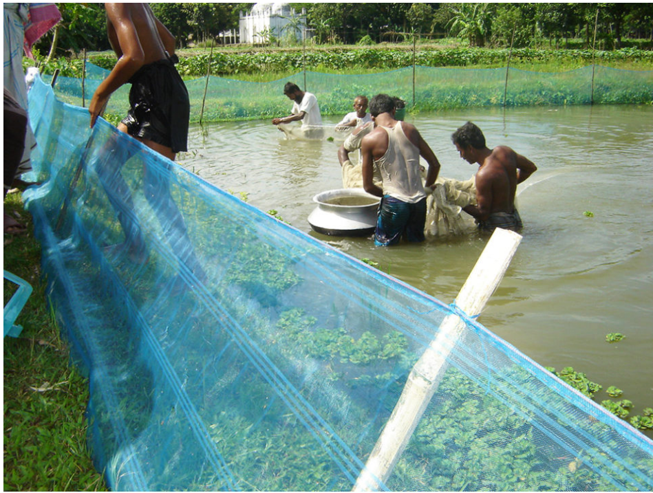
Netting surrounding ponds could protect escape of fish during floods.

The theme of the United Nations World Food Day on Oct. 16, 2016 (“Climate is changing, food and agriculture must too”) highlighted the links between climate change, sustainable agriculture and food security.