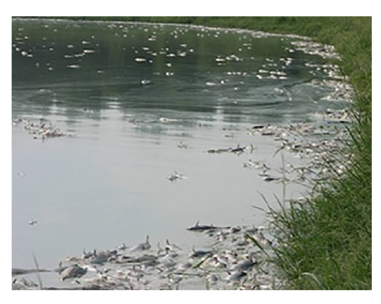
Virulent A. hydrophila outbreak in a west Alabama catfish pond.

Ten abraded fish were put into a 50liter tank filled with 15 liters of water. There were six replicate tanks, three of which were subjected to challenge with vAh and the other three were mock challenged for 1 hour; 3) Clipping of adipose fin: Fish were transferred to and anesthetized in a bucket as described in Treatment 2. The adipose fin, located medially between the dorsal and caudal fin, was individually clipped with a pair of scissors (about 80-85 percent of the fin was removed). A total of 80 adipose fin (Af) clipped fish was equally dispensed into eight 50-liter tanks filled with 15 liters of water, of which four tanks