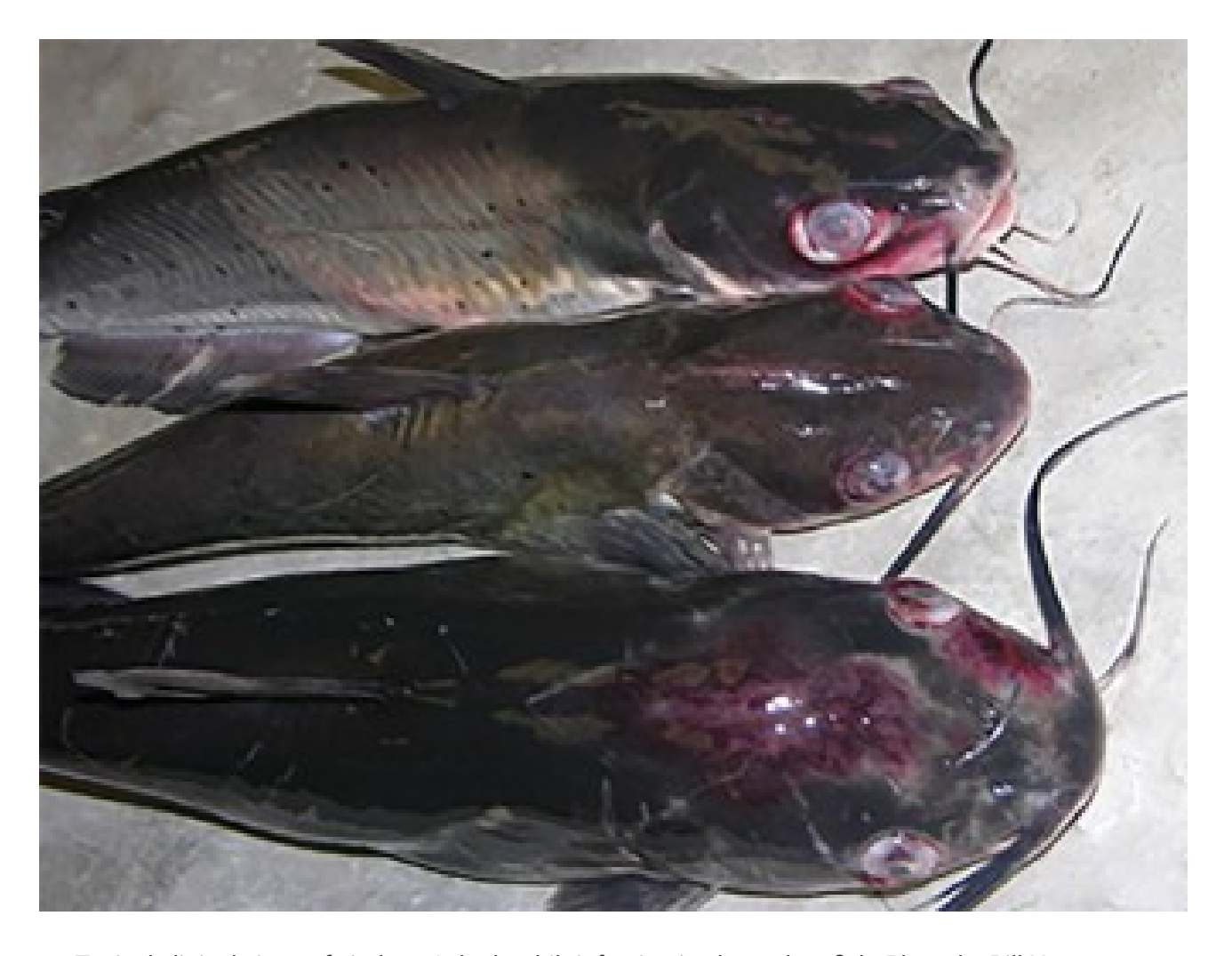
Typical clinical signs of virulent A. hydrophila infection in channel catfish.