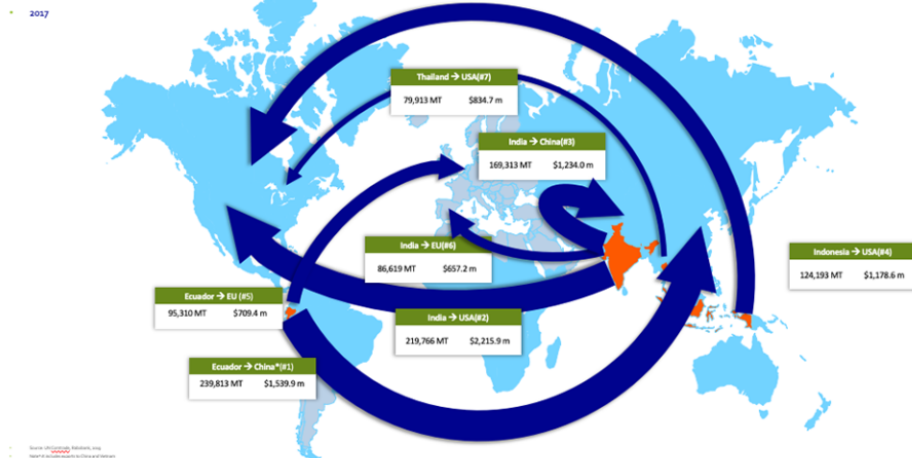
Fig. 2: Global shrimp trade flows in 2017.

“Look at the shift [of product] from Ecuador going to China, or to Vietnam – it’s no great secret it’s finding its way to China. The question that we’ve had for a few years is, ‘When will China become a net importer of shrimp?’ Well, we’ve gone to that point and way beyond it now,” said Larkin.