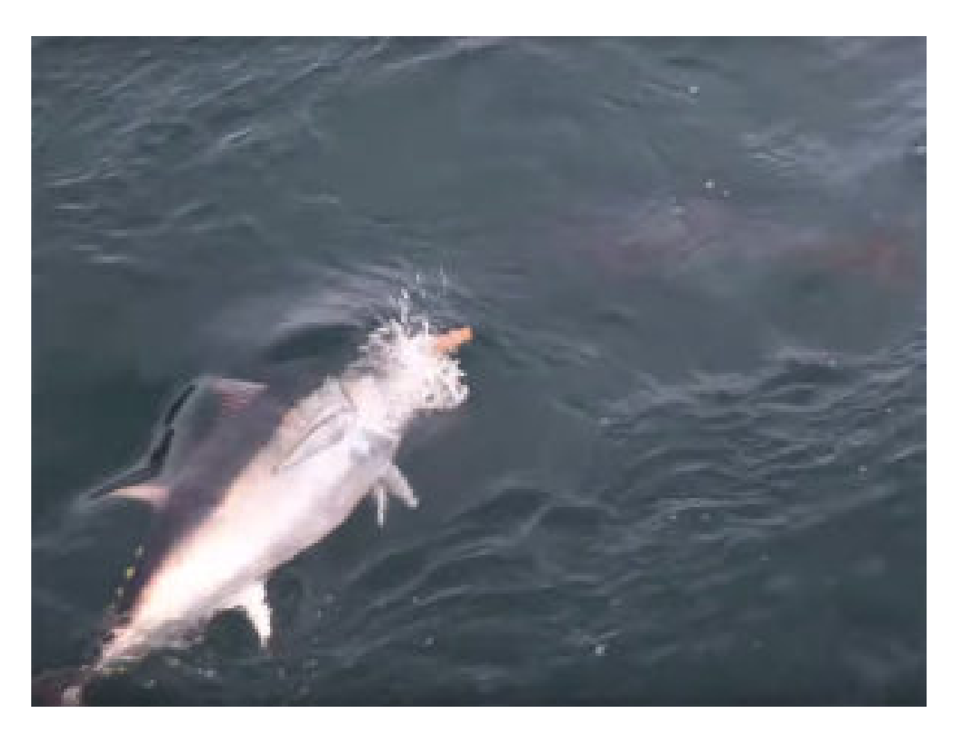
A new soy-based formulation successfully decreased the feed conversion ratio from 28:1 just 4:1.

happening." It's yellowfin, he says, that shows the most promise.