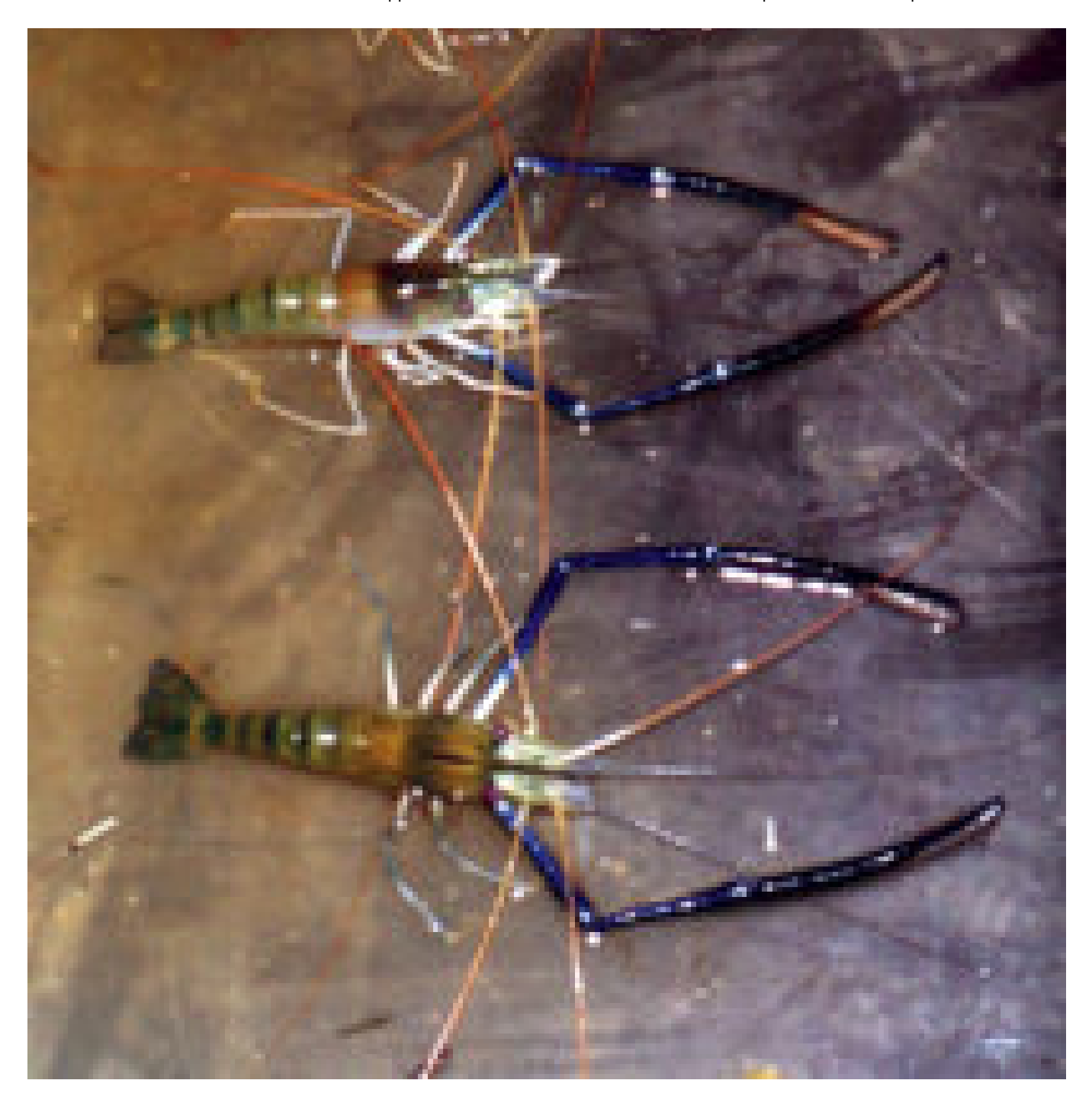
Although these male freshwater prawns are all the same age and were harvested from the same pond, their morphotypes vary greatly, from a runt animal to bull "blue claws."

Male freshwater prawns ( Macrobrachium rosenbergii ) display differential growth rates that contribute to wide variations of size within their populations, while females tend to grow at more uniform rates. In culture ponds, about 20 percent of the fastest-growing males develop long claws and are termed "bull" males or blue claw morphotypes. Approximately 60 percent of the males grow without a corresponding development of gonadal tissue. Termed orange claw morphotypes, they have moderate- length claws. The smallest 20 percent of the male population develop mature gonads but grow at a comparatively slower rate.