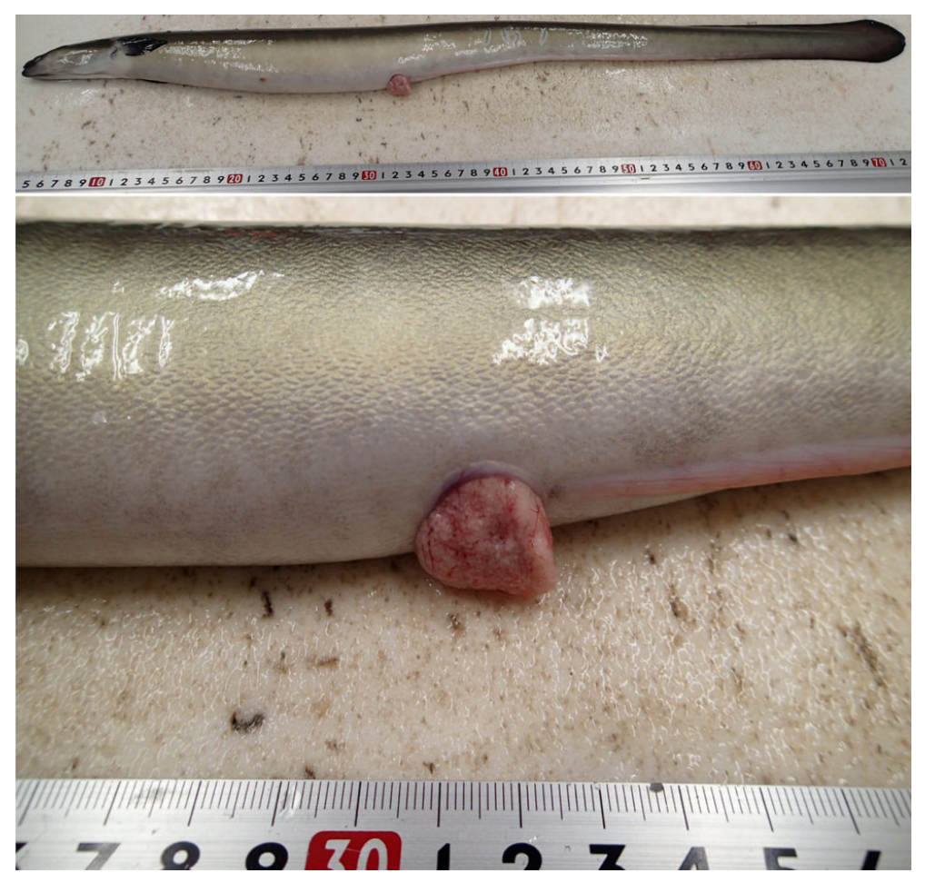
Fig. 1: Clogged oviduct after hormone-induced spawning in cultured eel.

This article – adapted and summarized from the <u>original publication</u> (https://doi.org/10.1371/journal.pone.0209063) – reports the results of a study that examined the differences between cultured and wild female eels, and possible causes of the ovulation problems frequently seen in cultured female eels, by using combined transcriptomic (techniques used to study an organism's sum of all of its RNA transcripts) and metabolomic (study of chemical processes involving metabolites, the small molecule intermediates and products of metabolism) analyses – also called trans-omics analysis.