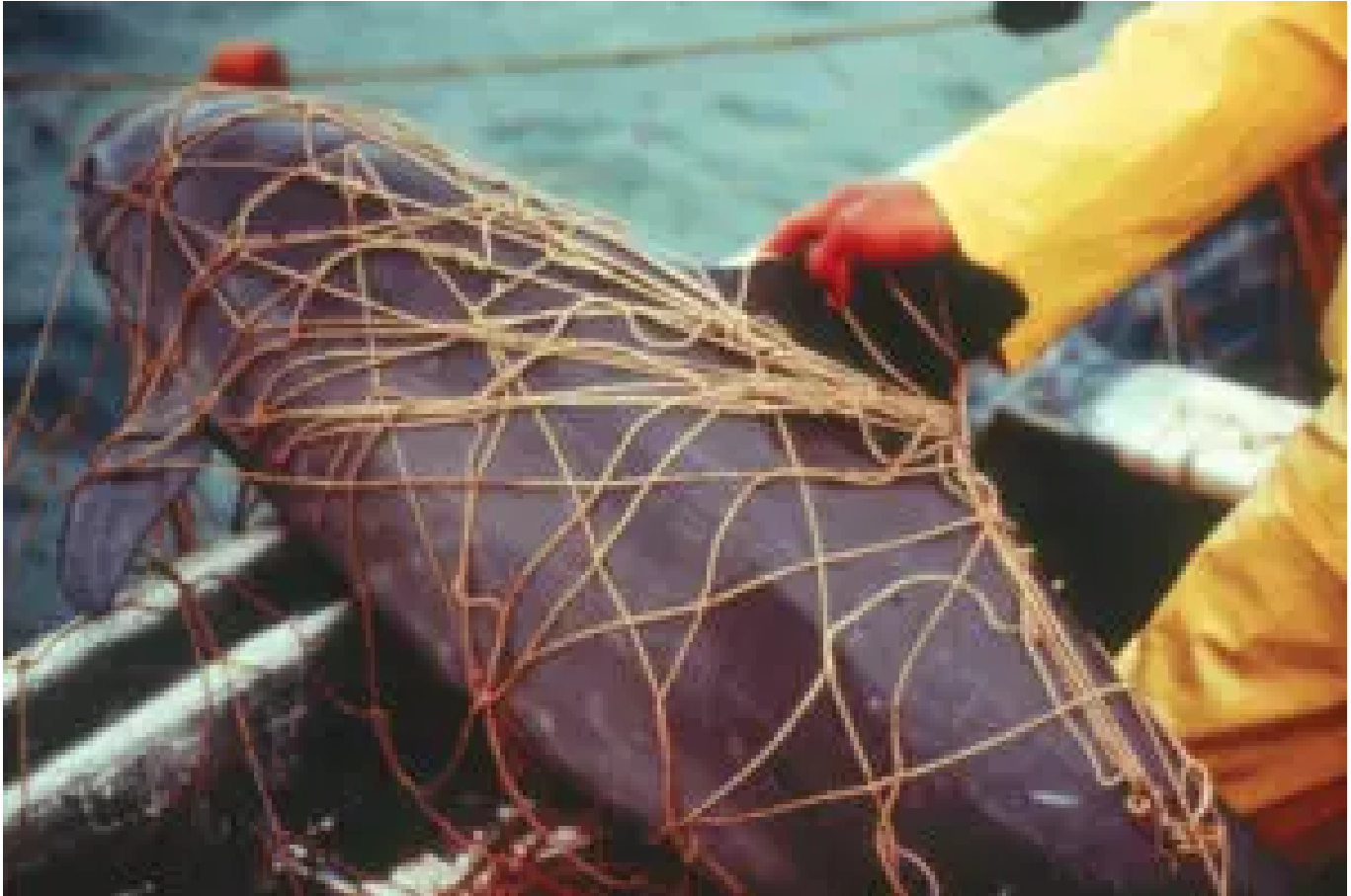
Rare vaquita porpoises have been entangled in illegal fishing gear in the Gulf of California, its only habitat. Only 30 of the world's smallest marine mammals remain.

Like rhinoceros horns and tiger pelts, trade in totoaba parts is illegal. But in China, where import regulations are lax or nonexistent, a hunger for them has existed for more than a century. A similar fish, the giant yellow croaker ( Bahaba taipingensis ), was fished to nearly the point of extinction in the south of China. Catches of giant yellow croaker nowadays merit newspaper articles, according to IUCN ( http://www.iucnredlist.org/details/61334/0 ), which reports that the current totoaba population is unknown. In fact, no official totoaba population assessment has been conducted for more than 40 years.