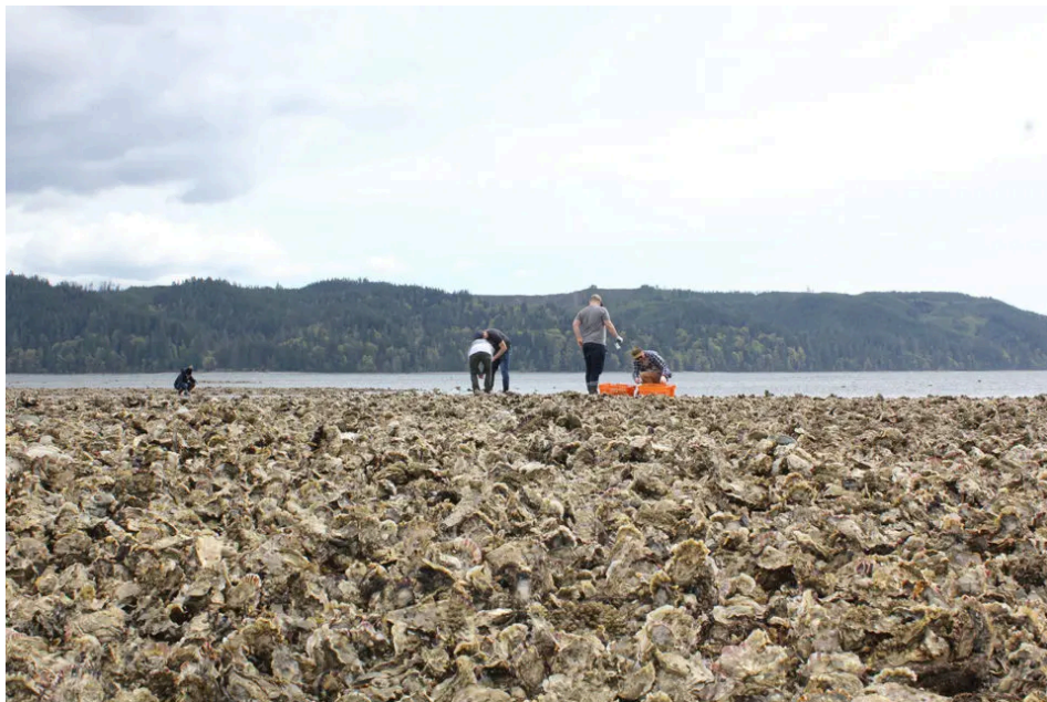
A Hamahama oyster farm in Washington state, USA.