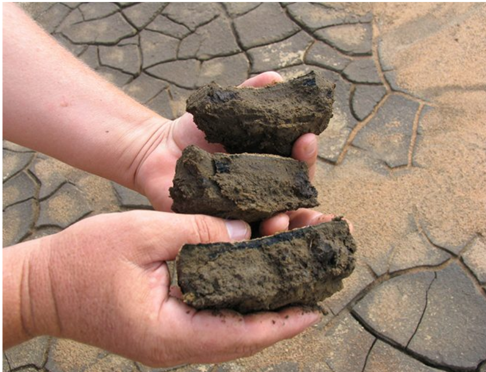
Pic. 1: In aquaculture ponds, the objective should be to maintain aerobic conditions – redox above 0.5 volt or more at the sediment-water interface.