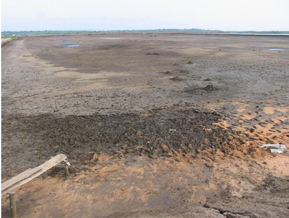
Pic. 2: When redox falls to around 0.2 to 0.3 volt, the color of the surface of the sediment (soil) will become darker – often dark gray or black.

electrode would be 0.560 volt. However, at 25 degrees-C and pH 7, the redox measured with a calomel electrode would be 0.547 volt even at 1 mg/L DO. Thus, as long as the water holds a small amount of DO, its redox potential is high.