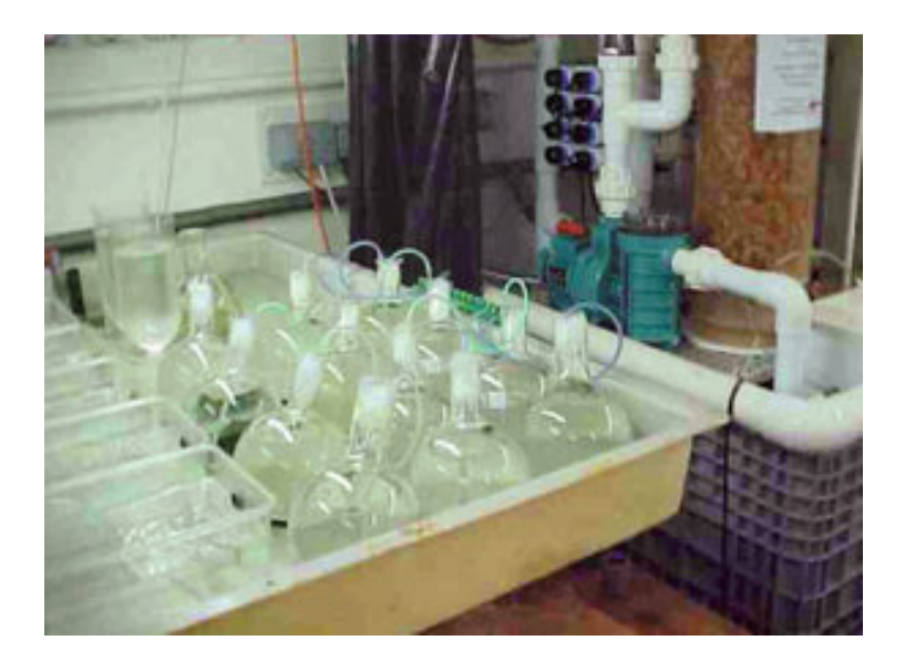
Two-I flasks used in the Fenneropenaeus indicus trial.

For instance, the extraordinary biological value of live food cannot be entirely explained by analyzing its biochemical composition. This special value is referred to as the "live food factor" in algae, artemia, squid, etc. These live food factors can be nutritional components, enzymes, attractants, hormones, antimicrobials or something else.