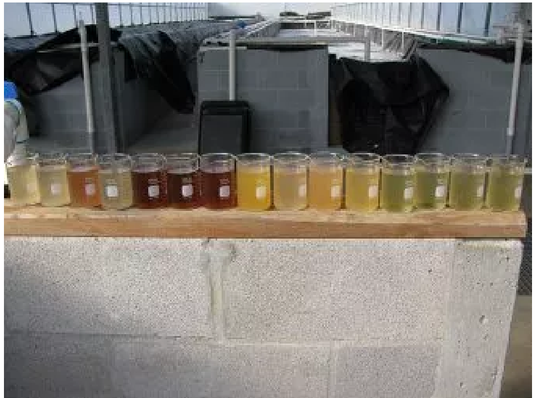
Water from the experimental tanks took on different colors based on treatment.

Shrimp production was similar among the HS, HG, and CA treatments, suggesting the potential equivalency of these management strategies. The addition of carbohydrates, increased oxygen demand, and larger volume of solids generated in the heterotrophic treatments represent costs of operation that were not factors in the chemoautotrophic treatment.