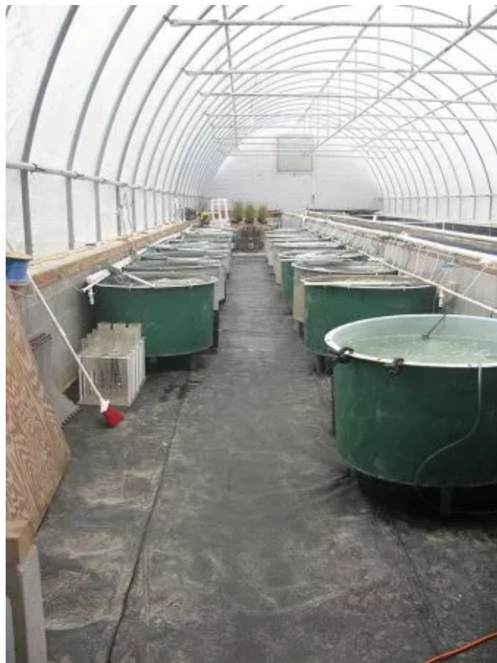
View of the experimental tanks used in this study.

For more detailed procedures on the experimental setup – including chemical analysis, oxygen demand calculations, and statistical analyses – refer to the original publication.