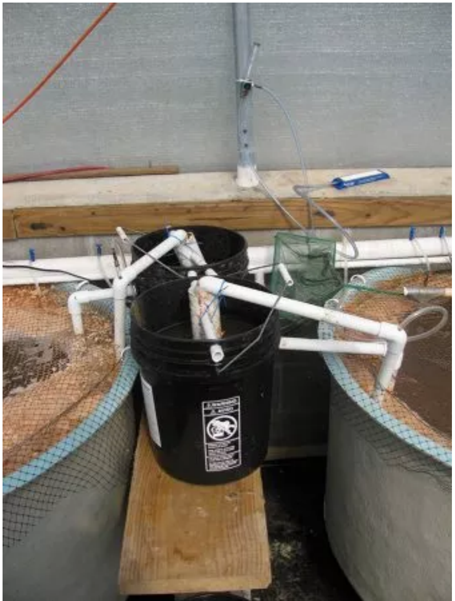
One of the settling chambers used in the study to remove solids.