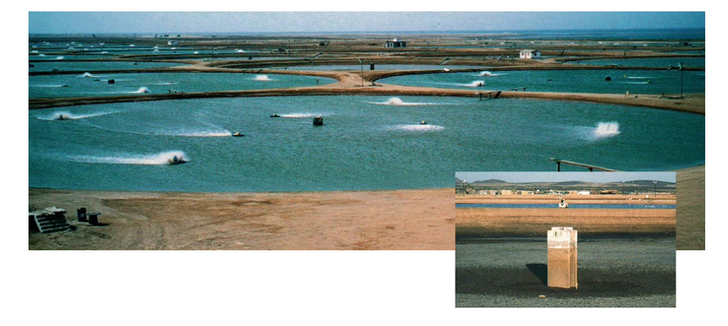
Fig. 2: This view of a production pond shows the tip of the central drainage structure and the current created by the aerators: four paddlewheels on the outer circle, and three air injectors in the center. Inset: Central drain and clean bottom with no black deposits four days after harvest.

Sustainable and profitable shrimp farming in Saudi Arabia « Global Aquaculture Advocate