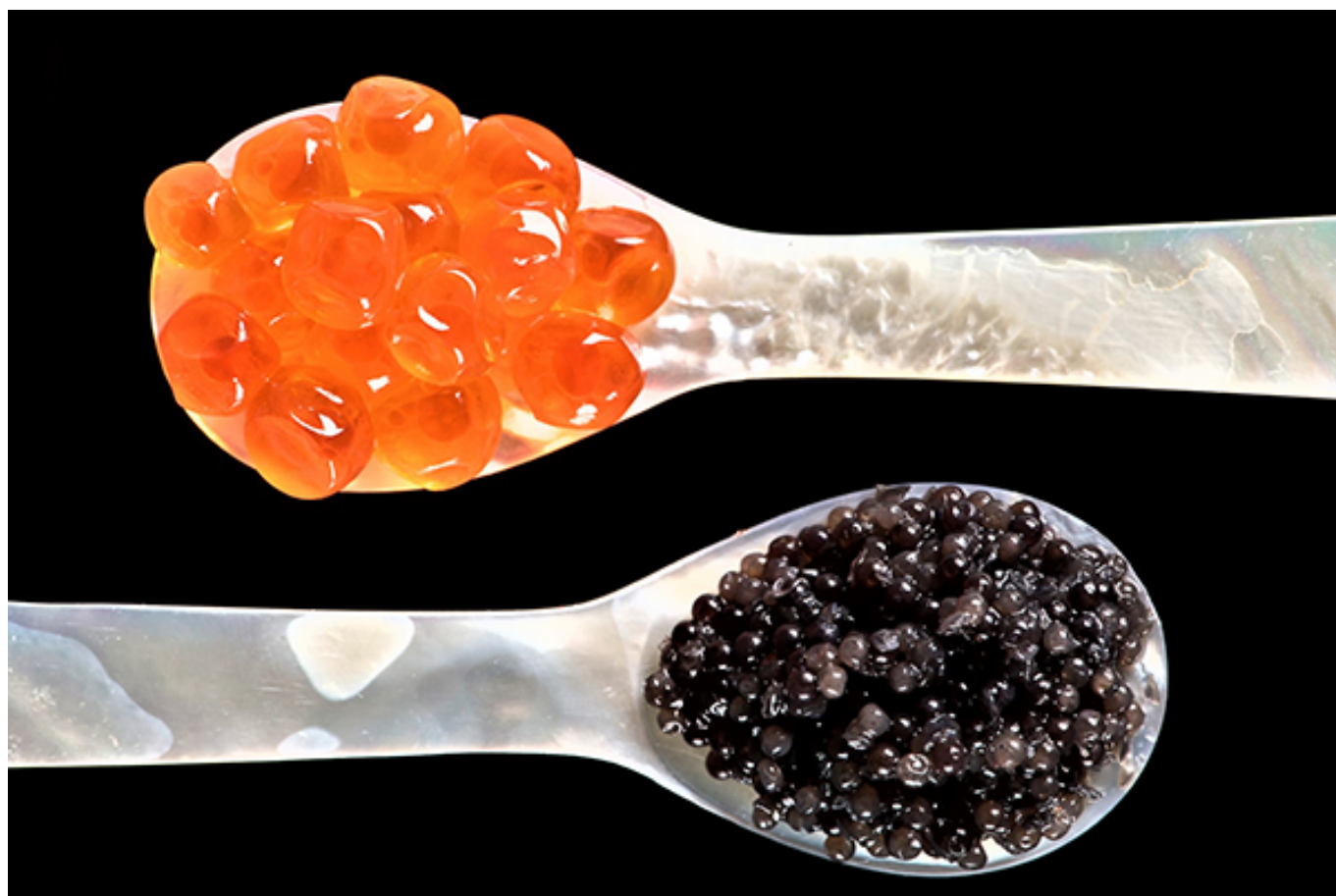
Mother of Pearl spoons with salmon roe (top) and sturgeon black caviar (bottom).

Genome engineering [or genome editing, a form of genetic engineering in which DNA is inserted, deleted, replaced or modified in the genome of a living organism] techniques such as chromosome manipulation, gynogenesis [asexual reproduction where the egg cell of the organism is able to develop, unfertilized, into an adult using only maternal genetic material] and androgenesis [development of an embryo that contains chromosomes from only the male parent] are useful in developmental biology, reproduction, genetics and sex determination, and conservation-related studies, as well as to improve aquaculture production.