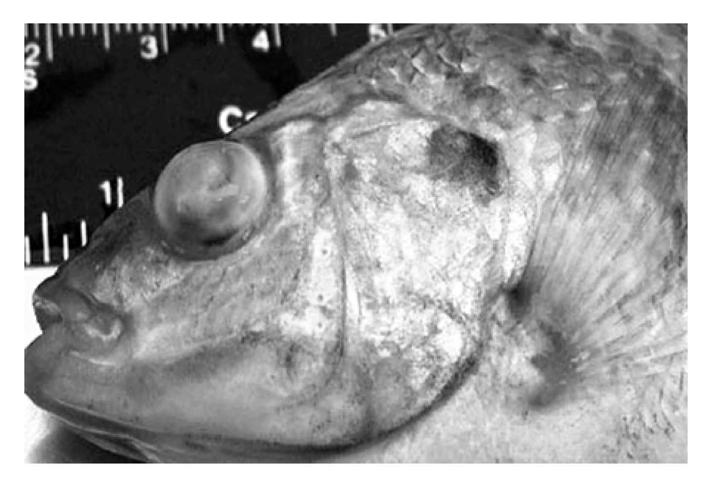
Fig. 1: This blue tilapia shows corneal opacity and exophthalmia three weeks after infection with S. iniae.