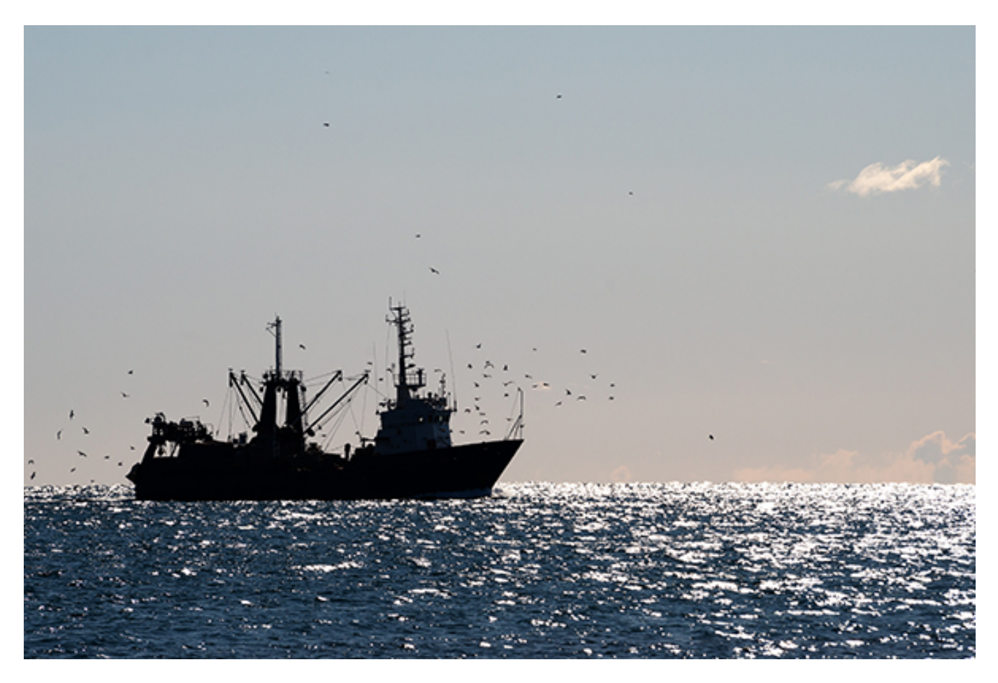
A new study indicates that more than 50 percent of assessed ports are associated with risk of labor abuse or IUU fishing.