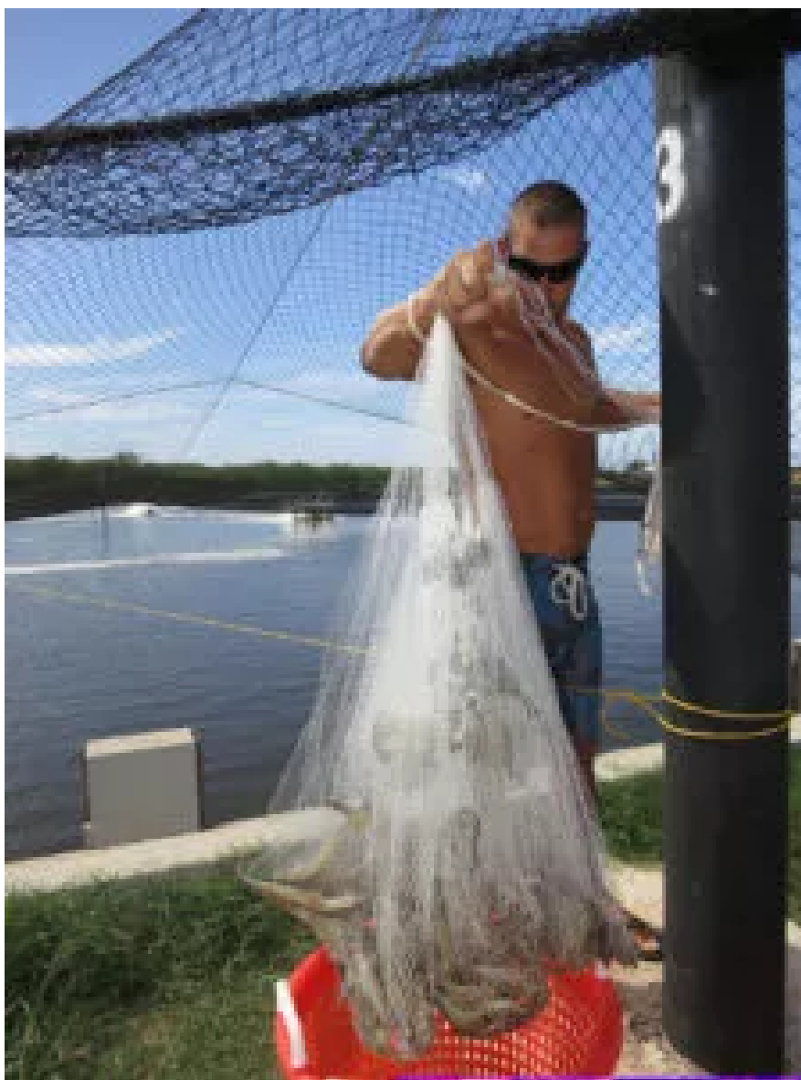
Kona Bay Marine Resources' SPF shrimp grow-out farm in Kauai.

Over time, and as shrimp farmers learned how to use the product, demand soared, and so did shrimp production in countries