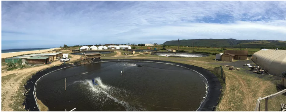
Kona Bay Marine Resources hatchery and breeding facility in Kona, Hawaii.

The industry now faces changes. The next step for shrimp breeding will be developing animals that aren’t just disease free, but disease resistant. The industry is also globalizing, with a growing number of broodstock suppliers setting up shop overseas. But shrimp breeders in the Aloha State aren’t worried. They say Hawaii-grown SPF is here to stay.