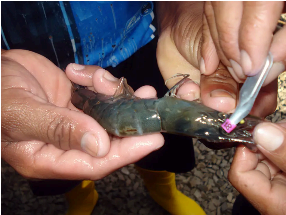
Individual broodstock received eye tags for identification.

Whether the improvement observed was a consequence of the program is something that cannot be easily ascertained with a simple mass-selection program. The 10 to 15 percent improvement verified could have been due to other factors. In the context of this genetic improvement scheme, the achievement of positive yearly phenotypic trends comparable to projected potential gains must provide sufficient verification, as the simplicity and low cost of the genetic improvement scheme defined can offer no better alternatives. This was accepted and understood by the partners in the program.