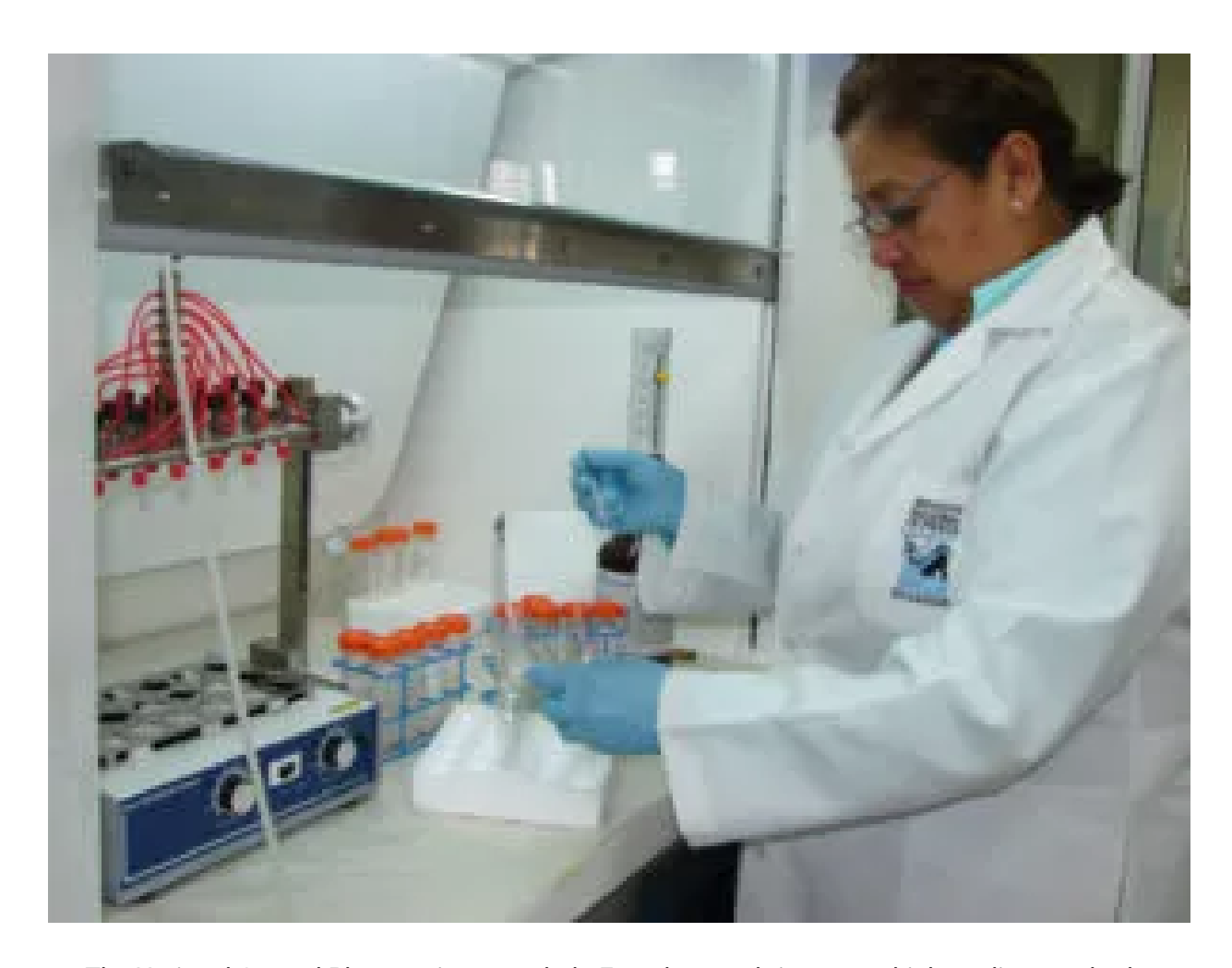
The National Control Plan requirements help Ecuadorean shrimp meet high quality standards.

Consequently, the national authority implemented a series of regulations, standardized with EU sanitary regulations, to certify the quality of the exported shrimp and to ensure traceability throughout the entire commercial chain. These requirements, established in what until today is still called the National Control Plan, have allowed Ecuadorian shrimp to