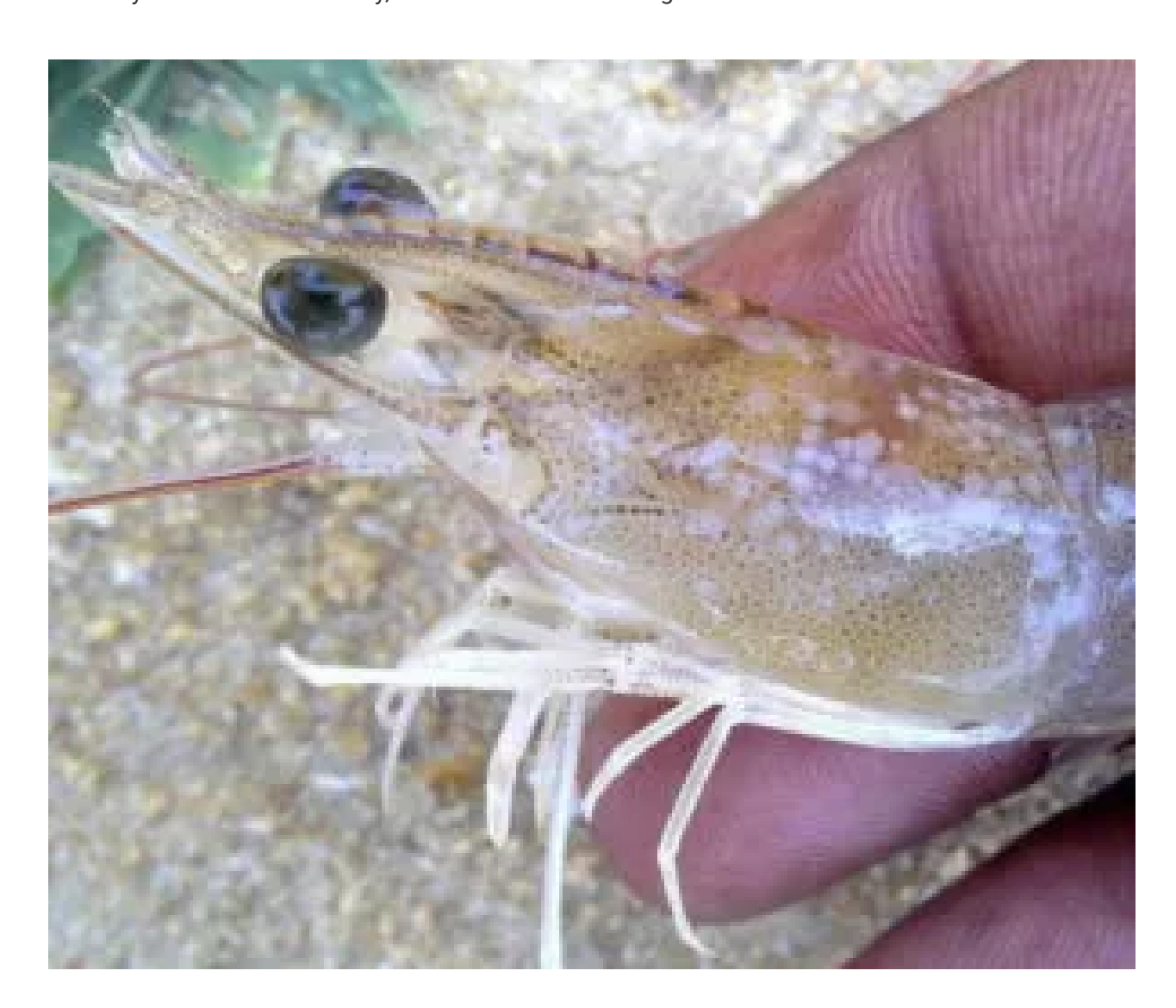
Sanitary barriers help protect the Ecuadorean shrimp farming industry from emerging diseases.

consultations with experts, the national authority implemented a sanitary barrier that prohibited the importation of shrimp in any of its development phases and products, and restricted the entry of certain inputs from countries where the disease had been declared or where there were atypical mortalities. The importation of products is subject to approval based on the recommendations of a commission that evaluates the risks of such imports, and is made up of representatives of the aquaculture authority, the industry and the academy.