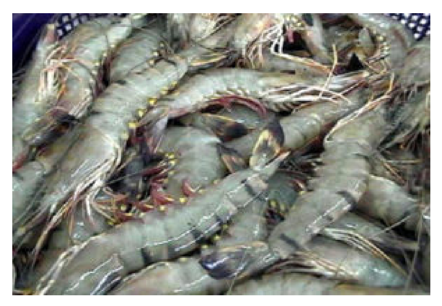
Black tiger shrimp are the only shrimp species formally farmed in Bangladesh, although the wild seed of other species can enter ponds and contribute to harvests.

Through a variety of programs, the Bangladesh Shrimp and Fish Foundation (BSFF) continues to assist the Bangladeshi aguaculture industry.