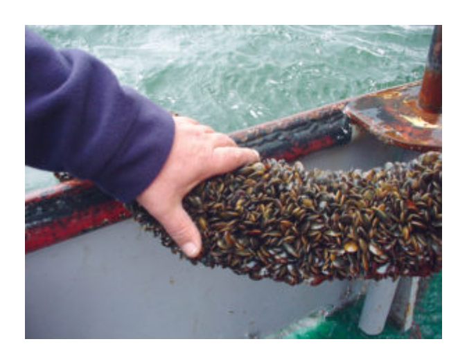
Mussel seed on a collector rope.

Shellfish culture in the Netherlands is mainly based on the production of blue mussels ( Mytilus edulis ). Traditional bottom culture is carried out on 4,000-hectare (ha) culture plots in the Wadden Sea in the north and 2,250-ha plots in the Oosterschelde, in the southwest. Annual production has decreased from 81,000 metric tons (MT) on average in the 1990s to 47,000 MT in the past eight years (Fig. 1). The average landing values increased from 48 million to 63 million euros (U.S. $61.2 million to $80.3 million) over these periods.