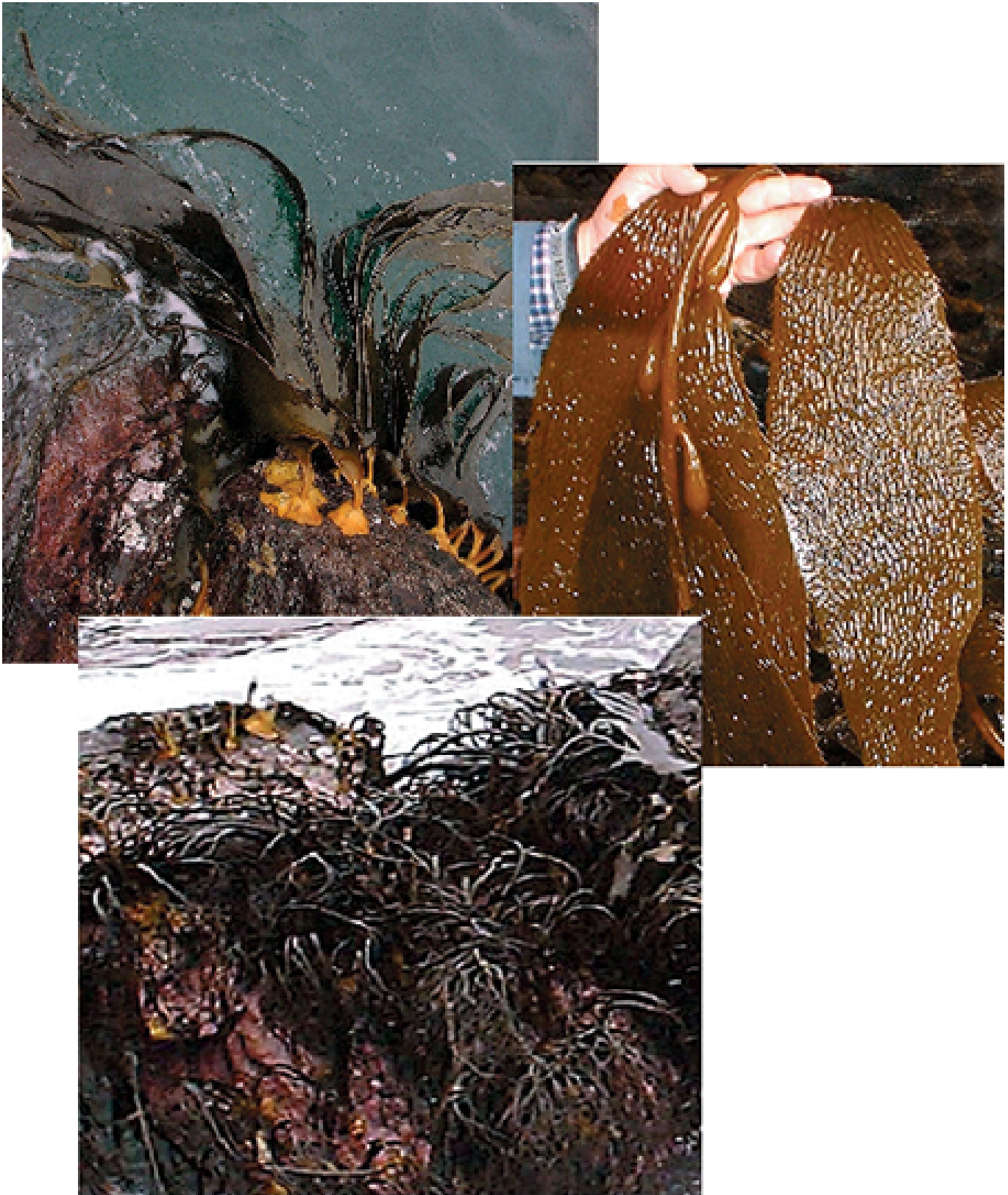
The brown algae Durvillaea antarctica (top left) provide products for humans. Macrocystis pyrifera (top right) is used as feed for abalone. Lessonia nigrescens (bottom) is processed for alginate.