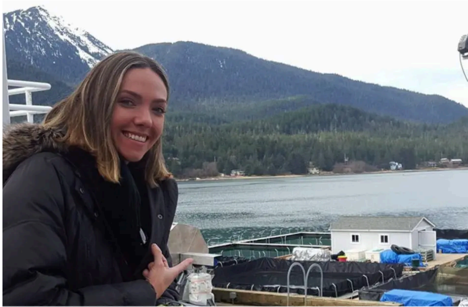
The author at a Juneau, Alaska, salmon hatchery.

Aquaculture is growing rapidly globally, but ecological science and conservation around aquatic farming have not kept pace.