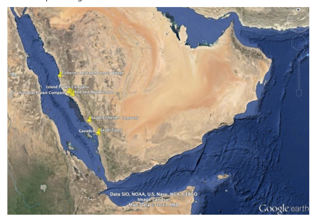
Fig. 1: Locations of shrimp farming facilities in the Kingdom of Saudi Arabia.

The shrimp farming industry in the Kingdom of Saudi Arabia (KSA) was started in 1995 with the culture of the Indian white shrimp ( Fenneropenaeus indicus ) grown under semi-intensive production conditions. The positive results obtained with this species in terms of growth rate, survival and flesh quality led to its commercialization as a premium shrimp in the international markets. The two regions where the shrimp farming industry developed in the KSA are located on the Red Sea shores, in Jizan in the south and in Al-lith in the north (Fig. 1). Both regions have excellent water quality and have optimal environments for shrimp farming.