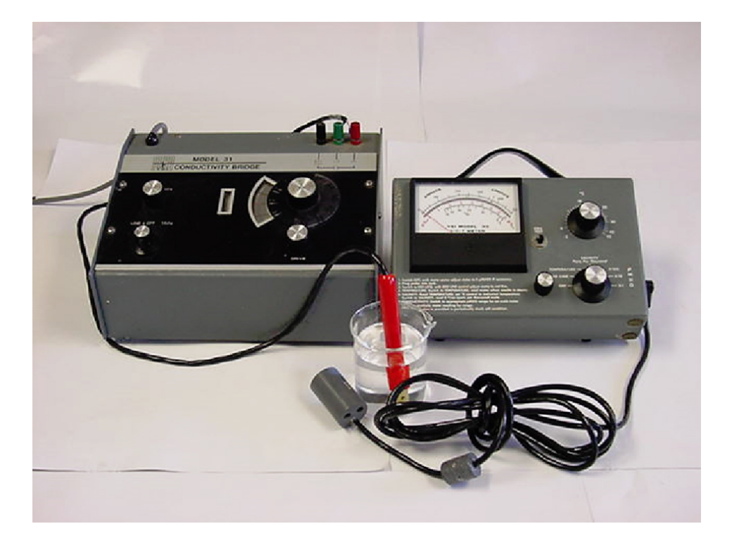
Fig. 1: A conductivity meter.

The ability of water to conduct electricity increases with greater salinity because electricity is conducted through water by free ions. A conductivity meter (Fig. 1) is basically a Wheatstone bridge – traditionally used to measure resistivity – modified to measure the reciprocal of resistivity or conductivity. The unit of resistance traditionally was the ohm, but to avoid using 1/ohm for conductivity, the unit mho (ohm spelled backwards) was adopted. The unit siemen also is used as the unit for conductivity, and 1 micromho/cm is the same as 1 microsiemen/cm. Conductivity increases with greater temperature, but most modern conductivity meters are temperature compensated to read out for 25 degrees-C.