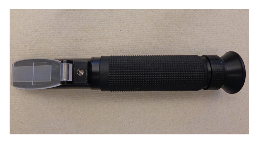
Fig. 4. A handheld, salinity refractometer.

Some aquaculture species such as ictalurid catfish, pangasius and common carp grow best at salinities of <5 g/L; species such as Atlantic salmon, tilapia and rainbow trout grow well up to 20 g/L salinity; estuarine species such as penaeid shrimp grow well at salinities of 2 to 40 g/L. Marine and estuarine species can be farmed in inland saline water, but they may not survive and grow well in spite of adequate salinity. This results from ionic imbalance caused by low concentrations of K^+ , Mg^{2+} , and Ca^{2+} or a combination of these cations. Mineral supplements are applied to increase concentrations of major ions.