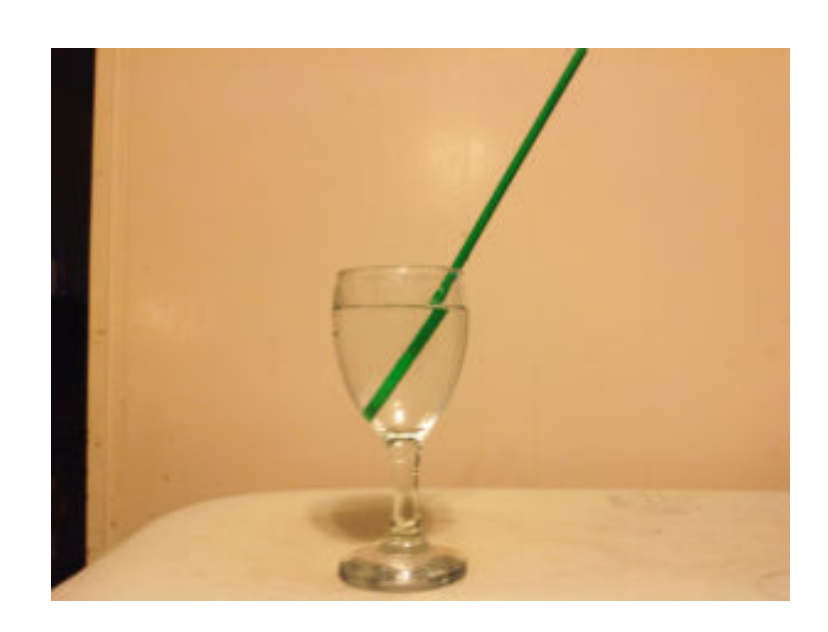
Fig. 3: Visual evidence that light is refracted by water.

The refractive index of water increases as a function of density, and is influenced also by wavelength of measurement, atmospheric pressure, and temperature. A good quality, handheld, salinity refractometers (Fig. 4) measure salinities of 1 to 60 mg/L to one decimal place. They are widely used to measure salinity at aquaculture facilities supplied with inland, saline water, estuarine water, or seawater.