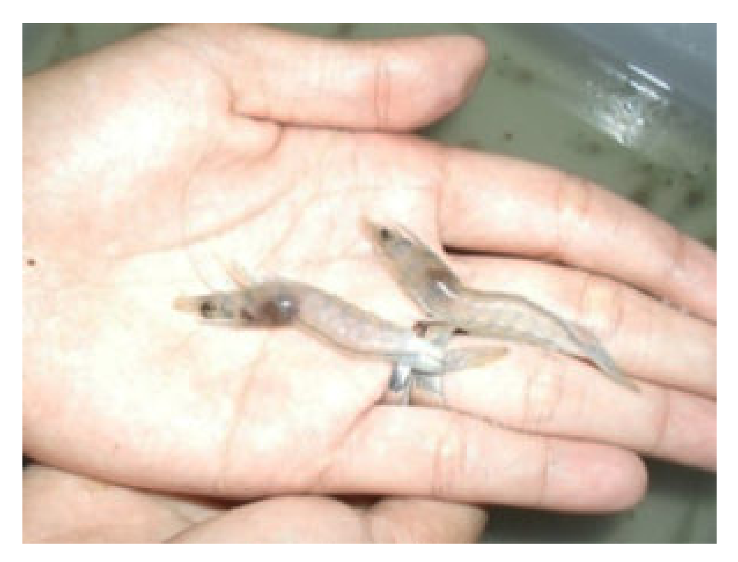
The addition of diatoms (Navicula sp.) and rotifers (B. plicatilis) to larval shrimp tanks every five days provides a significant natural food source for shrimp in their early stages in biofloc systems.