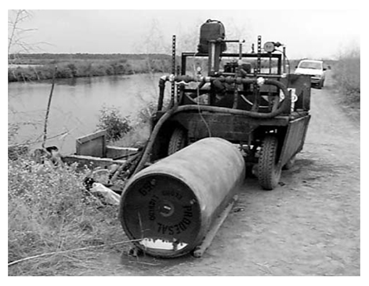
Chlorine gas being dosed from cylinder (foreground) to water entering inlet gate of shrimp pond (left).