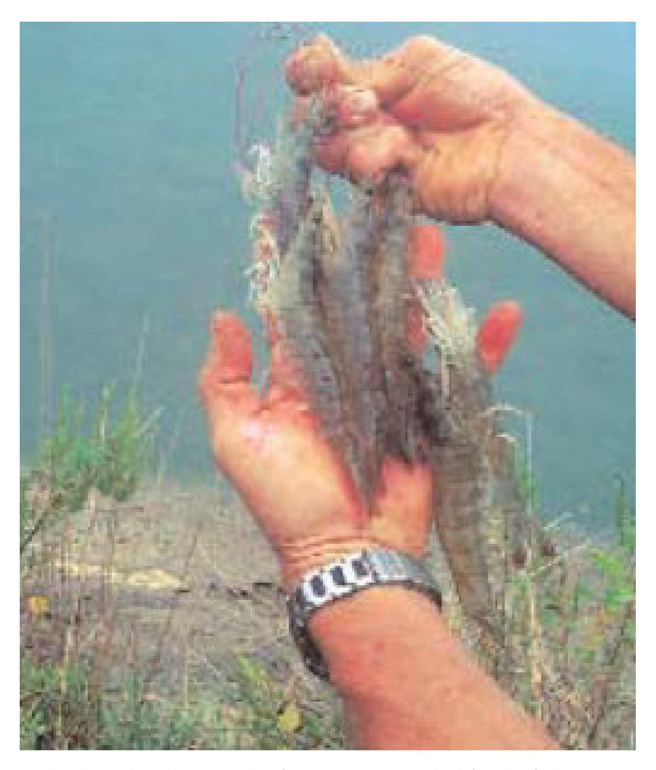
The authors achieved better growth performance in L. vannamei by shifting their feed regimes.