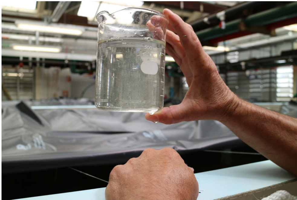
Pic 1. View of developing larval shrimp produced for the pond study.

Please refer to Sellers et al. (2019) ( https://doi.org/10.1016/j.aquaculture.2018.09.032 ) for more detailed information on the broodstock maturation and spawning methods, larval rearing, PL counting and pond stocking methods, shrimp grow-out and sampling methods as well as TNA extraction, cDNA synthesis and TaqMan real-time qPCR testing and data statistical analyses.