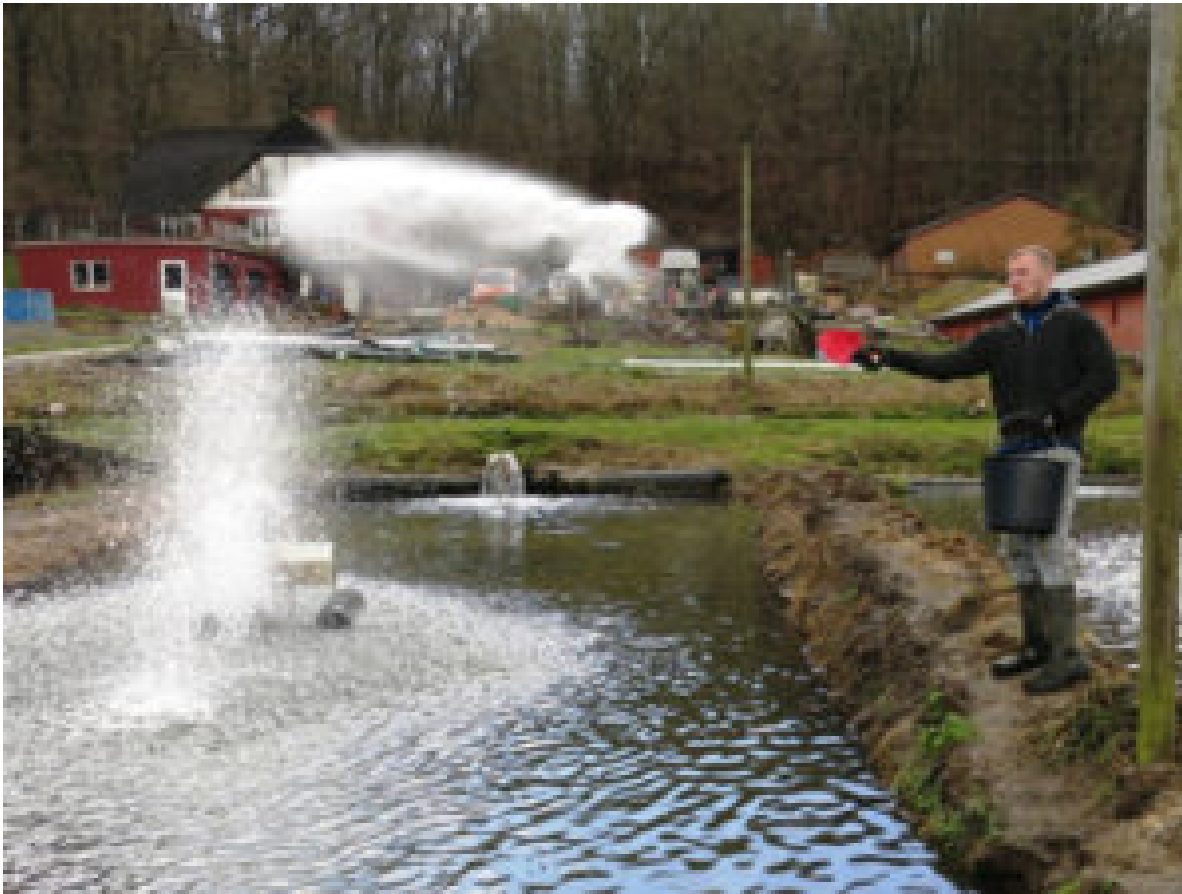
Example of manual application of the hydrogen peroxide-containing powder product SPC.