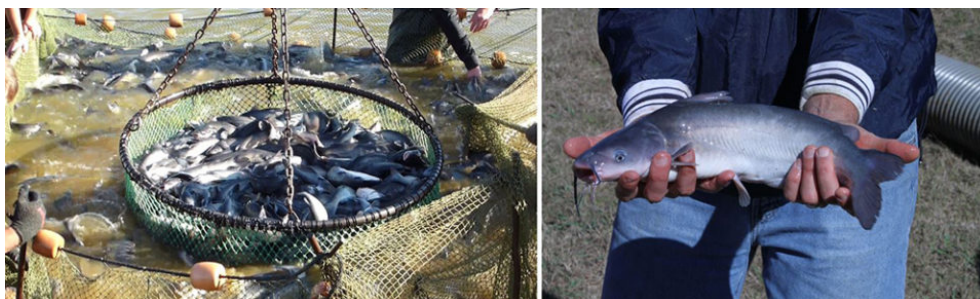
Production results at the end of the IPRS study at Auburn University were very promising.

Fish survival ranged from 75 to 95.7 percent. Fortunately, as fish were still small during the bacterial outbreaks, the loss of fish biomass did not cause too much impact on overall yield and feed conversion. Also noteworthy is the much-reduced cost of these treatments in smaller raceways compared to treating entire ponds.