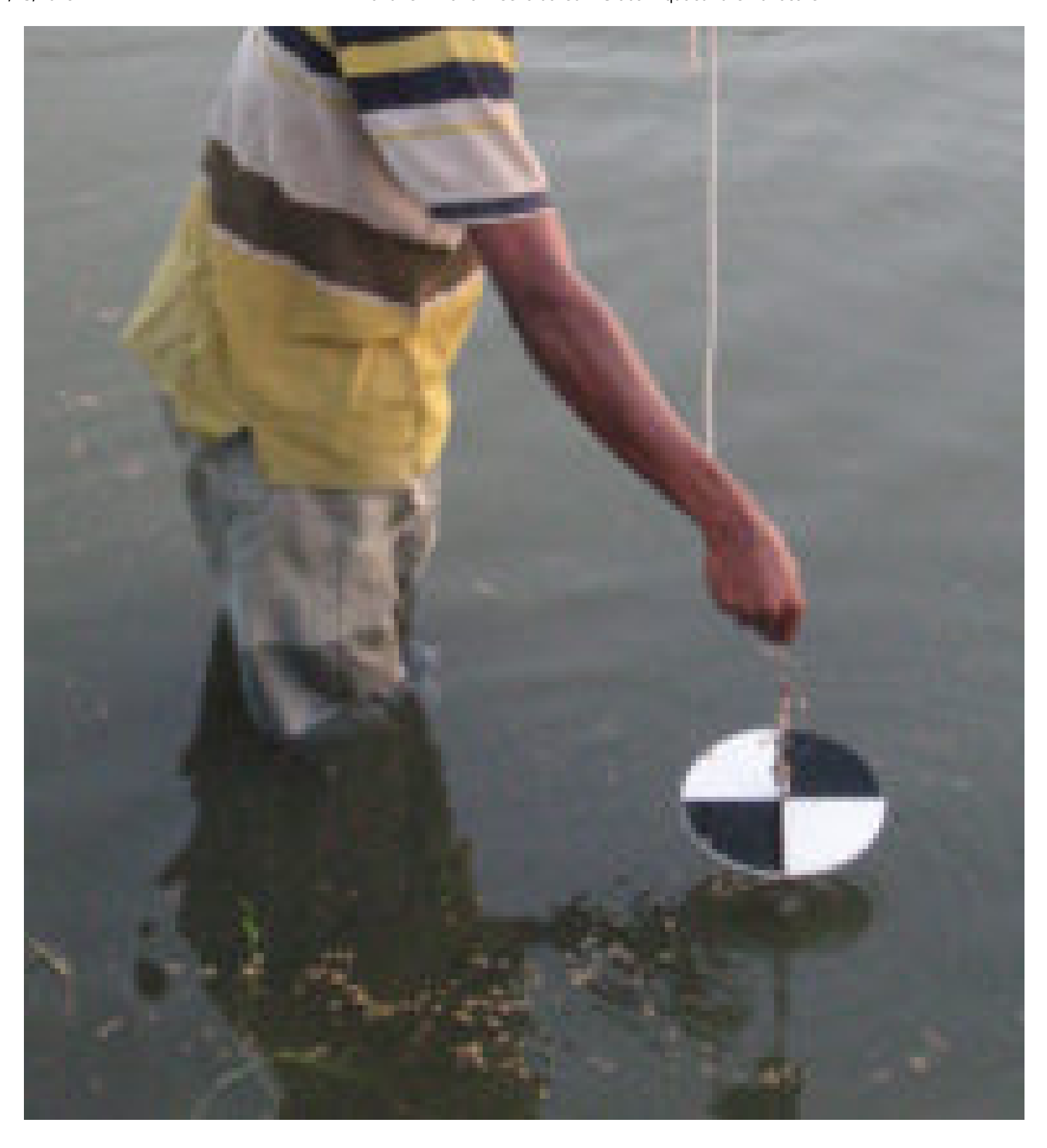
After initial fertilization establishes an adequate bloom, the frequency of fertilization can be adjusted based on bloom density and Secchi disk visibility.

Fertilizer application rates should be based on the findings of experiments that ascertained the amounts of nitrogen and phosphorus that should be applied per hectare to provide satisfactory fish or shrimp production. The optimum fertilizer rate for new ponds or older ponds from which sediment was removed was 6 kg/ha of nitrogen and 3 kg/ha of phosphorus oxide (P_2O_5) – for a nitrogen to phosphorus (N:P) ratio of 4.58:1.