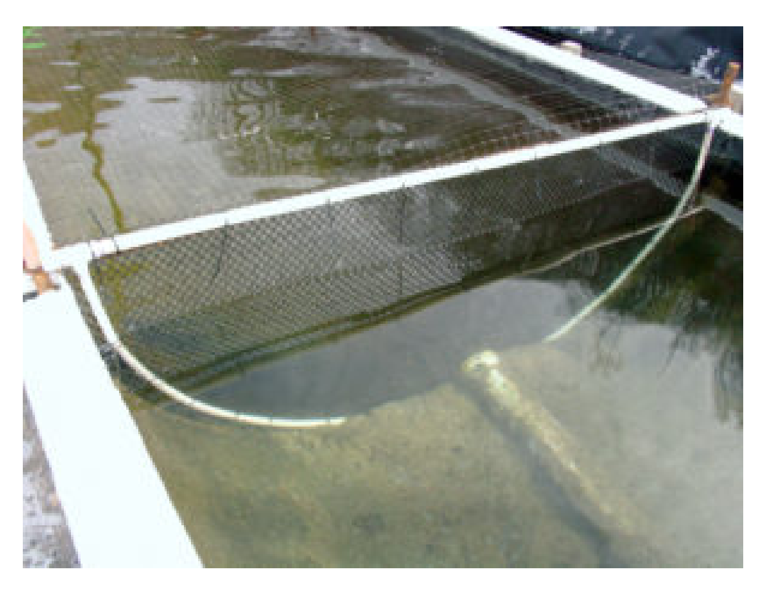
Hydrostatic water pressure pushed the solids that accumulated around the manifold into the off- solids removal pipe.