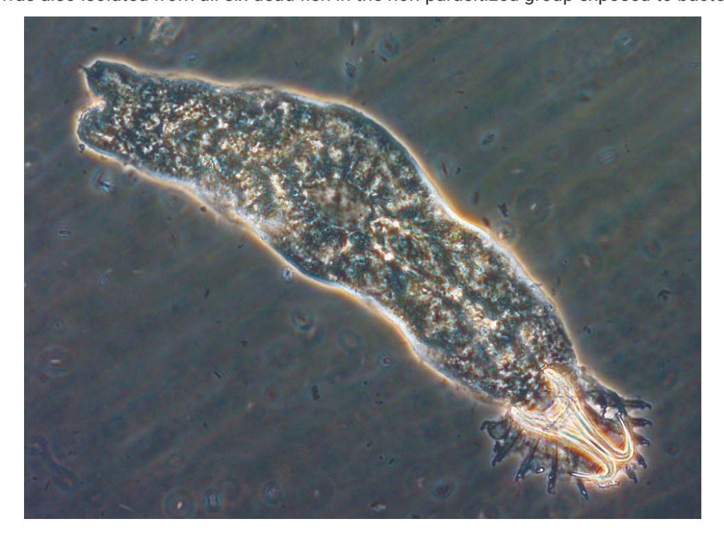
Gyrodactylus is a small, elongate parasite with one pair of large anchors and 16 marginal hooklets.

Bacterial samples from the dead tilapia were incubated on agar plates and identified with biochemical tests. Streptococcus iniae was isolated from 35 of 38 dead fish from the group infected by Gyrodactylus following bacteria challenge. S. iniae was also isolated from all six dead fish in the non-parasitized group exposed to bacterial challenge.