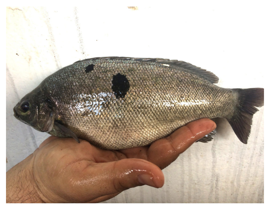
Fig. 1: Jade perch at approximately 300 grams, and with distinctive body markings.