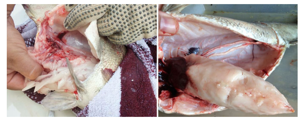
Fig. 5: Views of large amounts of fat inside a market size Jade perch in Malaysia.

One strategy to improve the fatty acid composition of fish can include the use of finishing diets that contain higher amounts of fish oil or microalgae oils that are rich in omega-3 fatty acids. This was shown to be relatively effective in jade perch (Van Hoestenberghe et al. 2013), however, these oils can be expensive and thus leave little incentive for farmers to adopt. Alternative strategies, such as biofloc technology or aquamimicry to encourage natural foods in the water, could be an area worth exploring to potentially enhance the nutritive value of jade perch.