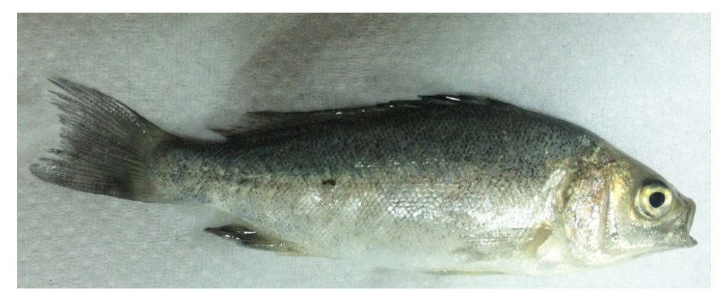
Figure 2. Jade Perch fingerling.

Jade perch fingerlings (Fig. 2) were purchased from SA Agromax Enterprises, Petaling Jaya, Selangor, Malaysia, and transferred to Sepang Today Aquaculture Centre (STAC), Pelek, Selangor. During their acclimation, the fish were fed commercial floating pellets (Star Feedmills, Malaysia; crude protein of 43 percent and crude lipid of 6 percent), designed for Asian sea bass ( Lates calcarifer ) three times each day. This feeding frequency was chosen based on our prior research showing this was optimal for growth (Al-Khafaji et al. 2017), while these pellets were chosen based on their relatively high omega-3 content.