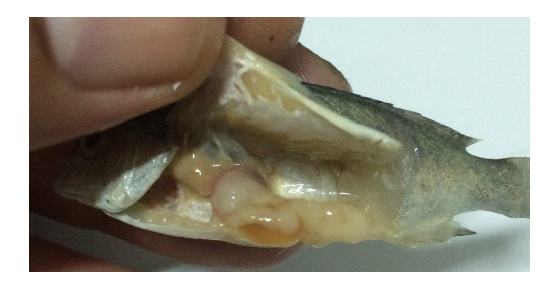
Fig. 4: View of fat inside a Jade Perch juvenile.

Table 1. Proximate composition (% wet weight) of whole body and muscle of Jade Perch juveniles.