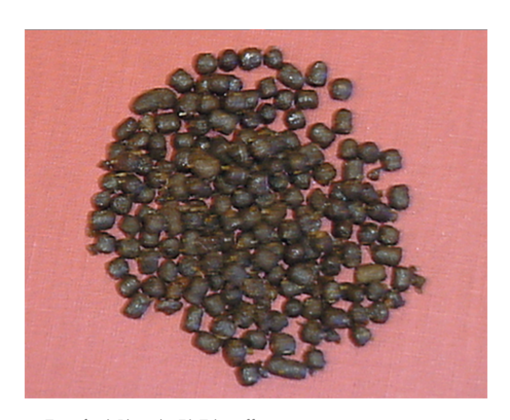
Trout feed.

These factors included conditioning temperature, feeding rate, moisture content of the extrudate, screw speed, and torque and pressure measured behind the die. Several of these factors may influence the nutritional value of the feed, and accordingly, digestibility of cysteine differed significantly between the two feed production days. Several previous studies have shown that digestibility of cysteine is sensitive to changes in feed and ingredient processing. Thus, the results indicate that other processing factors