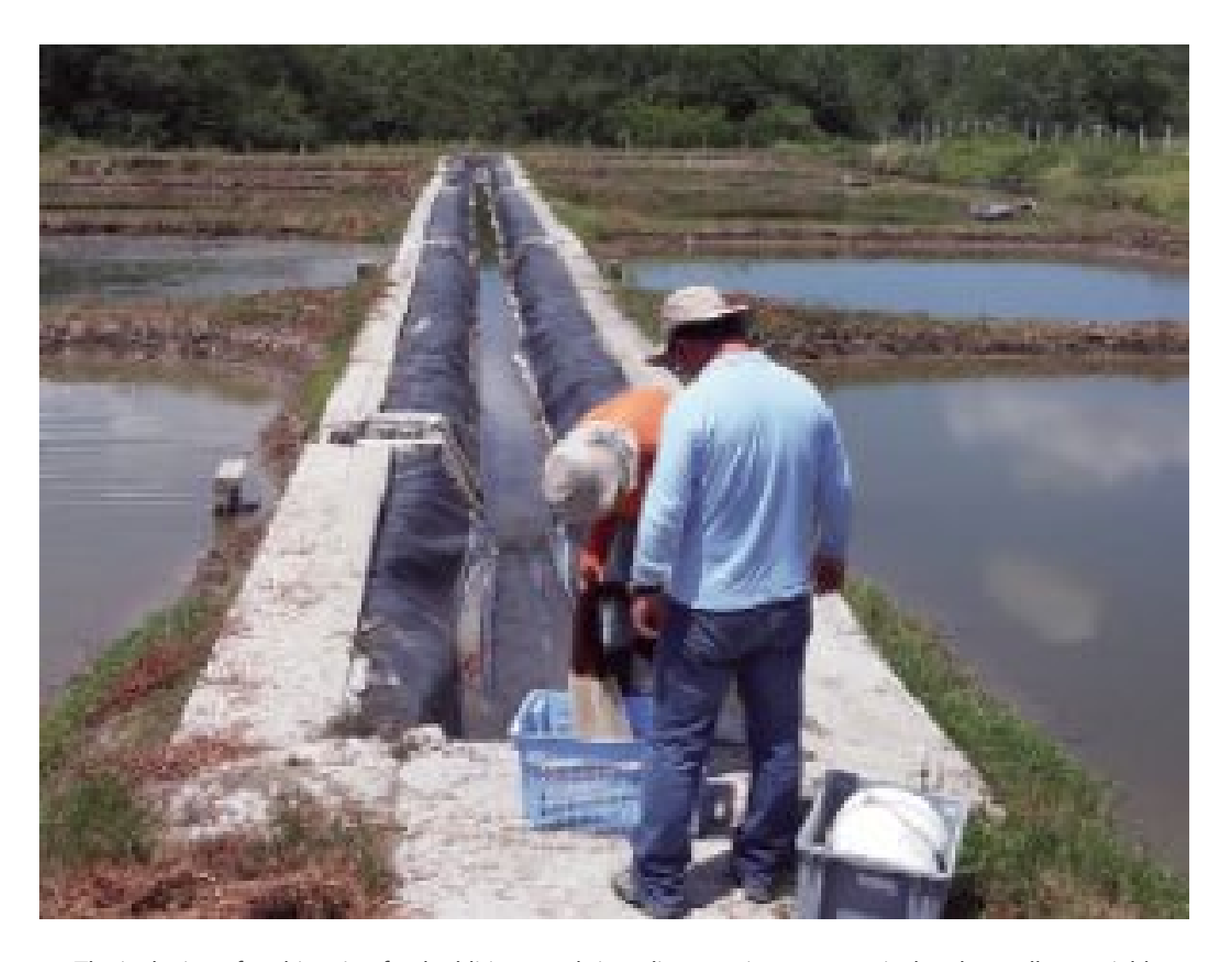
The inclusion of multi-action feed additives to shrimp diets can improve survival and overall crop yield.