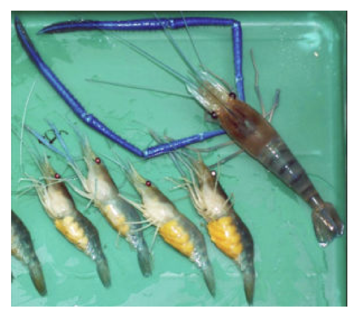
Macrobrachium rosenbergii males (right) grow faster and reach higher weights than females of the species, all-male culture improves harvests.