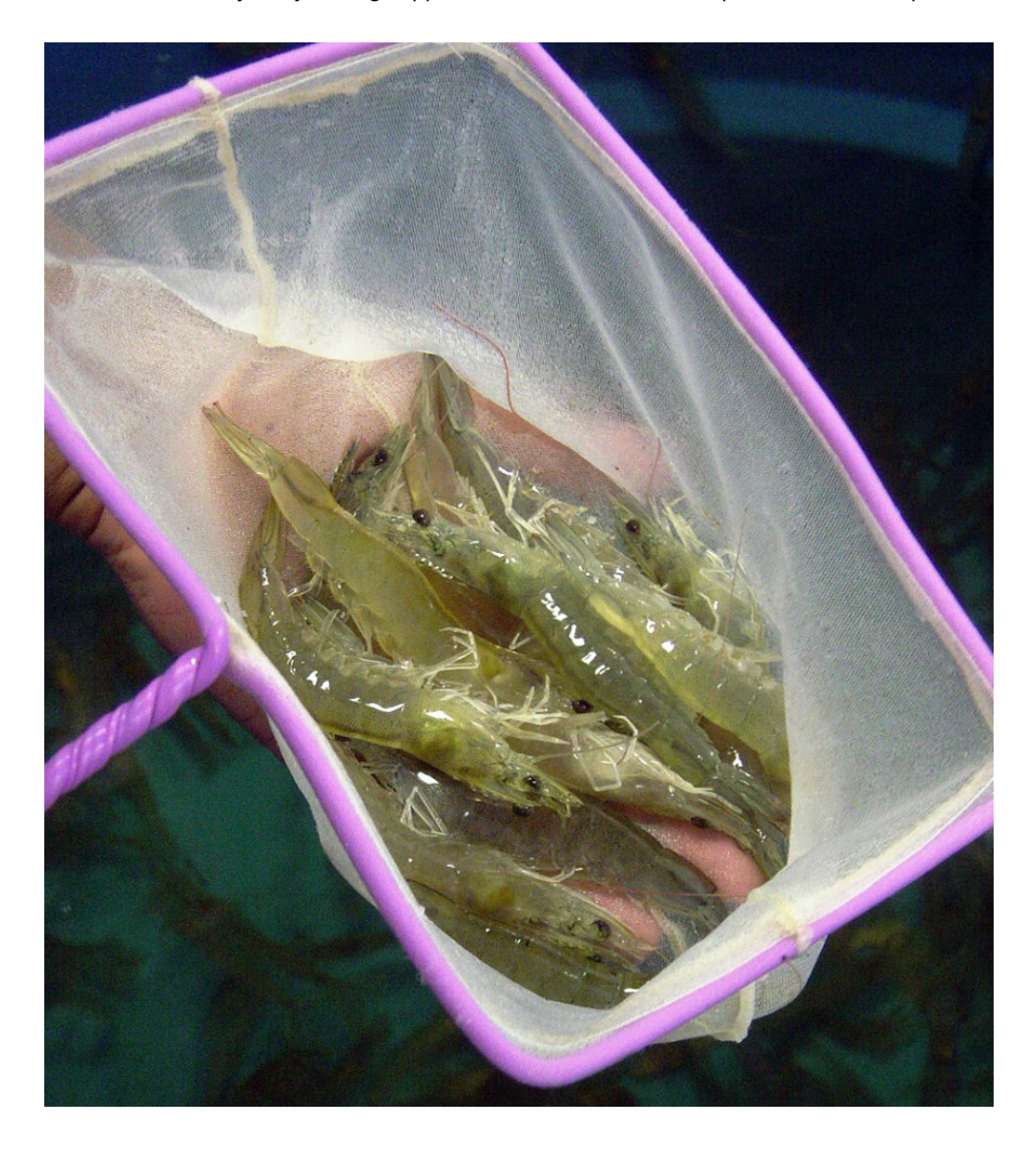
Shrimp harvested after 96 days of rearing weighed about 11 g.