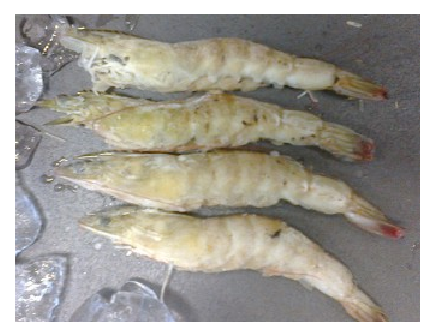
Naturally infected shrimp collected at a local farm were used to produce an IHHNV inoculum for the study.

Our results suggest that the batch with higher susceptibility to IHHNV infection may have lower genetic diversity, whereas the least susceptible batch may have higher genetic diversity. This is consistent with earlier research by Alcivar-Warren and colleagues (1999), who worked with families of the Pacific white shrimp and reported that the more diverse the genetic makeup of shrimp, the lower its susceptibility to a pathogen.