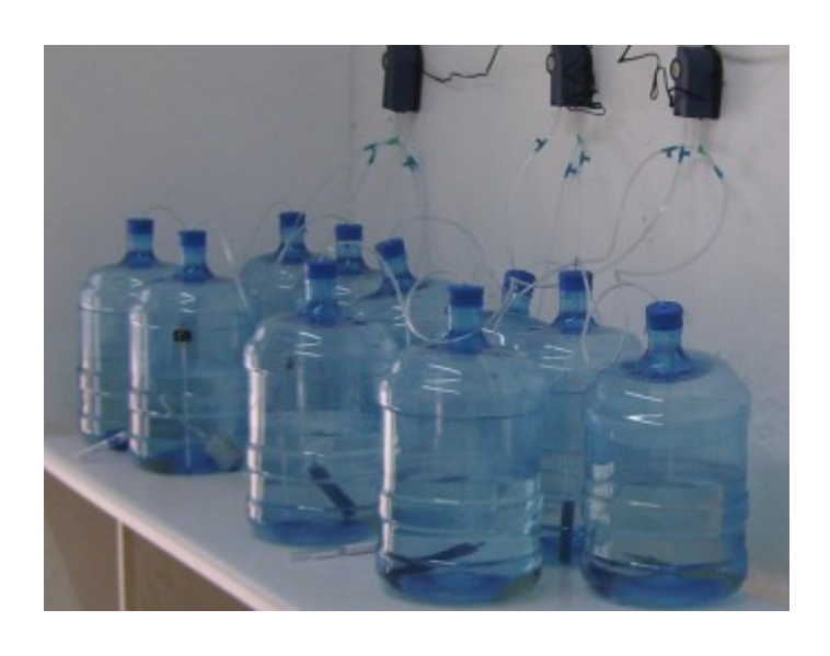
View of the experimental units used in the study.