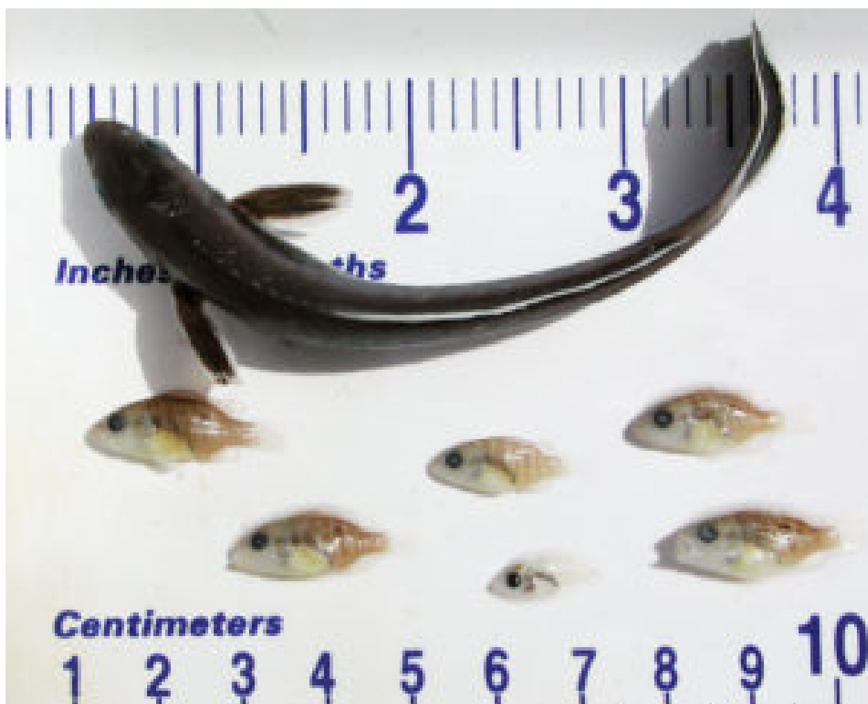
Cobia (top) and snappers 45 days after hatching. The cobia reflects an impressive growth rate.