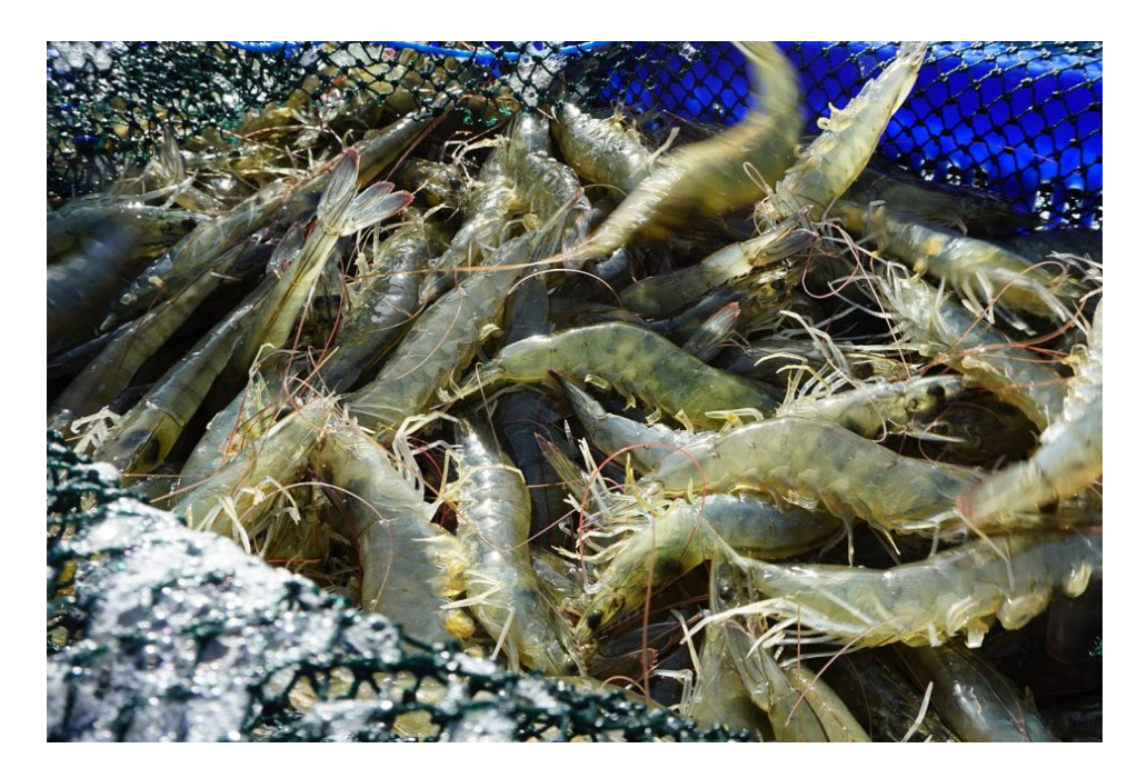
Aqualyso, a lyso-phospholipid-based digestibility enhancer for fish and shrimp from Adisseo, can help relieve cost pressure from oil and lecithin prices.

Global fishmeal and fish oil prices are, to a large extent, linked to the supply situation in South America (Peru and Chile) and demand from Asia (primarily China). Peru is the largest source of fishmeal and fish oil output today and the world's largest producer and exporter of fishmeal and fish oil. An unsuccessful season in Peru might cause as much as a 20% decrease in global output. Given the quota size and the potential impacts on the stock from this year's El Niño, Peru has recently canceled the first fishing season for anchovy in the north-central zone, creating new challenges for the global market of fishmeal and fish oil.