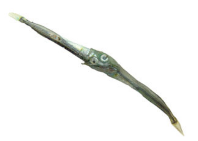
Cannibalism was seen in much younger and smaller fish than in previous years.

The lingcod larvae hatched at approximately 8 mm and began feeding within a couple of days. The larvae were reared in 2-m-diameter 10.000-I bags. The lingcod were fed a combination of enriched artemia nauplii, wild-captured zooplankton and frozen copepods. The larvae were gradually weaned onto prepared feeds 60 to 90 days post-hatch at a length of 40 to 50 mm. At this stage, they were size graded and moved from the mesocosm bags to small net pens.