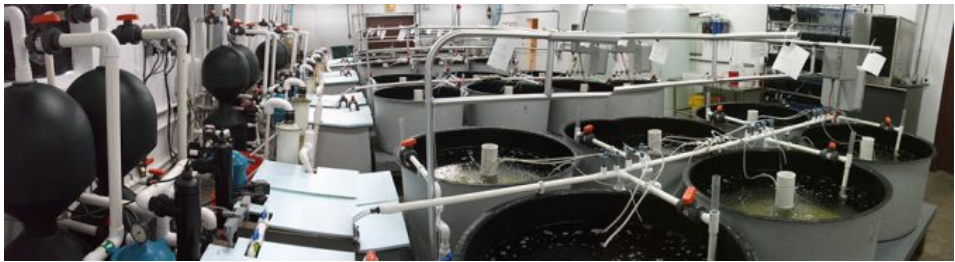
View of experimental tanks and setup for studies on cobia nutrition at SIU.