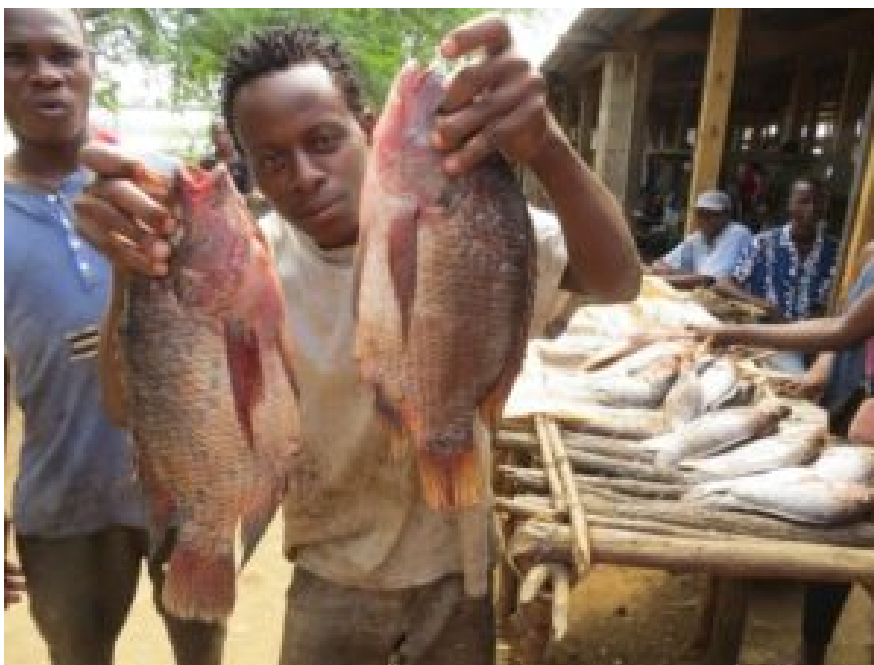
Workers at the Chicoa Fish Farm.

Velings isn't deterred by what isn't there, at least in terms of roads, energy and distribution and storage facilities. Instead, Velings said the risks associated with investing in aquaculture operations in Africa currently stem from a paucity of options to invest in.