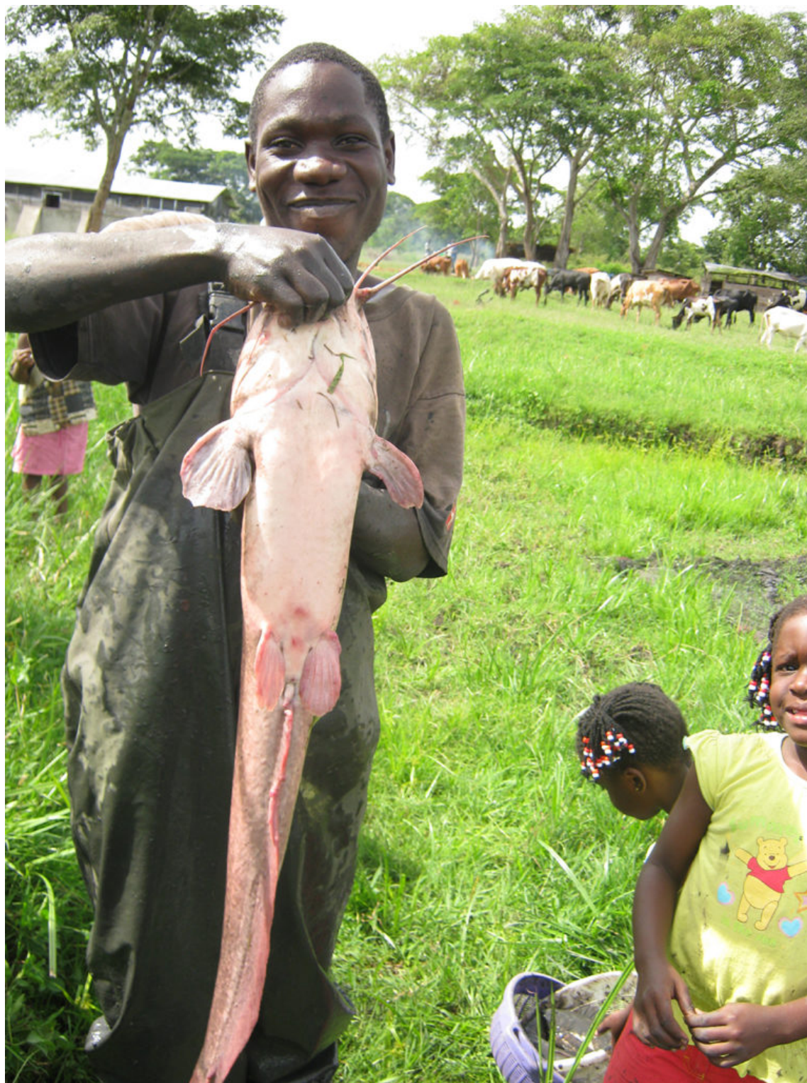
A Ugandan farmer with catfish broodstock, photographed in 2011 by Anton Immink.