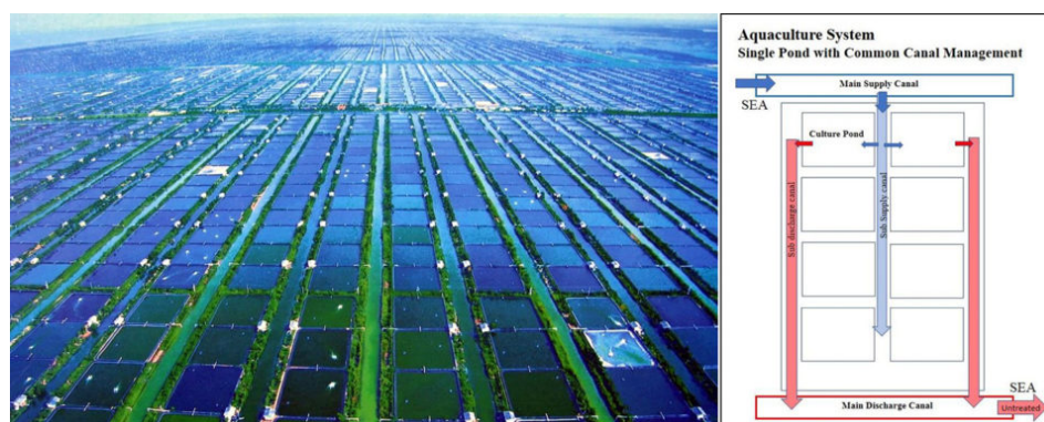
Fig. 1: View of the Dipasena Shrimp Farm, Indonesia.

The farm was originally designed and constructed based on single pond operators and a common canal management system. Ponds were arranged in rows with supply and discharge canals on opposite sides. The main effluent canals were built not only to discharge drainage waters from culture ponds, but also to be utilized as waterways for logistical management purposes by speed boats and barges. The water source was directly from the coast area, whereas the wastewater was discharged into large upstream rivers adjacent to the farms. Production operations using canals and a single pond system for the production of black tiger shrimp, Penaeus monodon , were successful until the emergence of viral pathogens, especially WSSV in the mid-1990s.