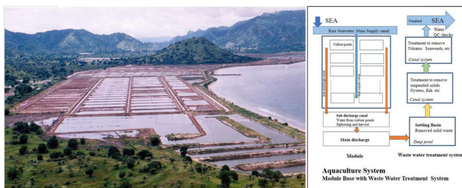
Fig. 3: View of SAJ shrimp farm in Sumbawa (Taw 2001).

The PT Sekar Abadi Jaya (SAJ) shrimp farm in West Sumbawa, Indonesia, used sea water directly for its production ponds. The farm had an efficient effluent treatment system starting with a settling basin and raceway canals, two stages where effluents (tested and approved by the Indonesian Department of Environment) were treated before being discharged back to the ocean.