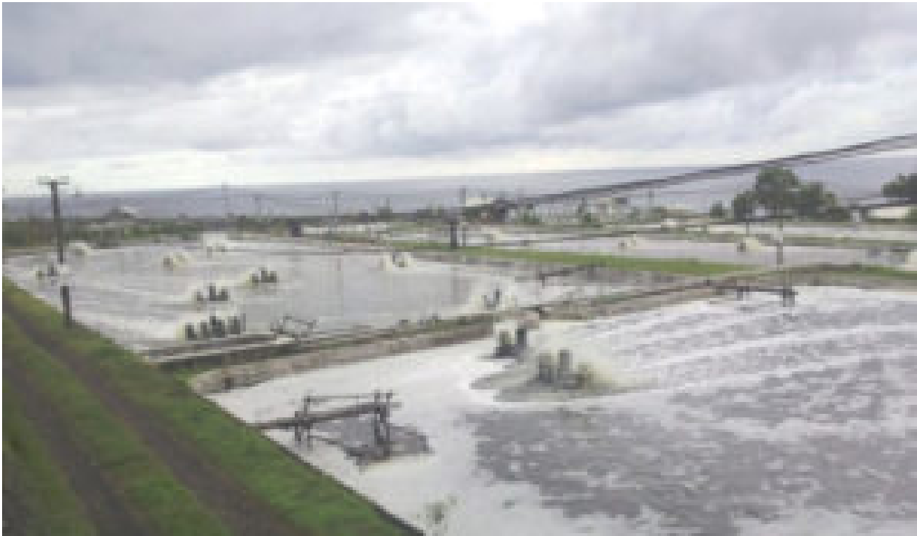
Intensive shrimp farm in Bali, Indonesia producing shrimp in a biofloc system (Taw and Setio, 2014).

aquaculture system (RAS) production technologies and/or treating incoming water for culture operations and wastewater treatment as biosecurity measures for disease prevention and control.