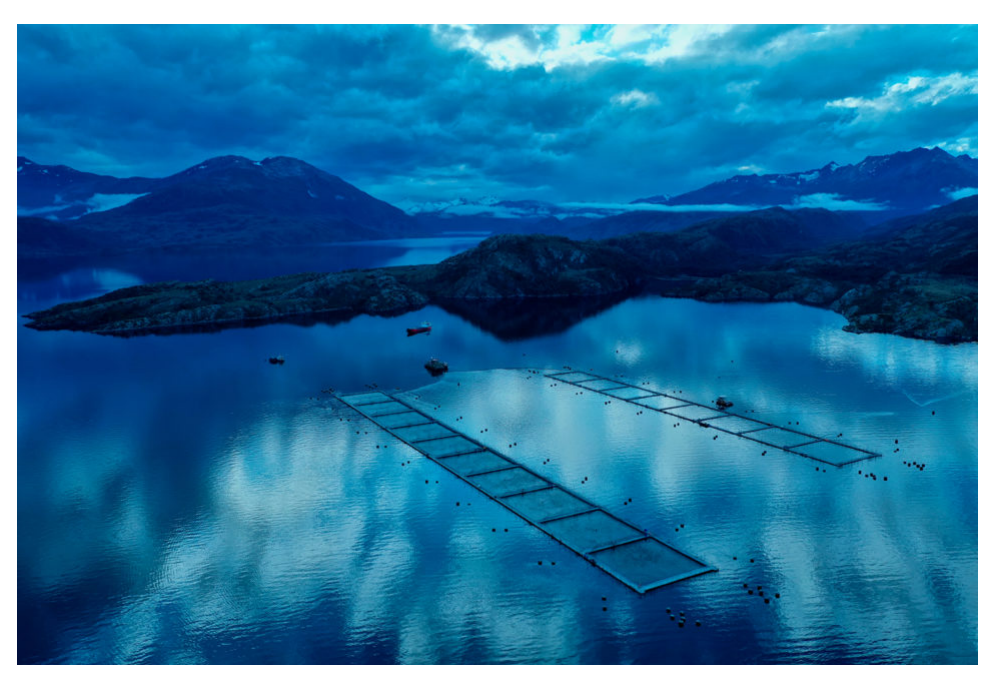
Nuseed worked with partners in Chile to conduct commercial scale trials on Atlantic salmon.

Studies in the field indicate that Nuseed's canola oil can provide a benefit when used in feed, according to Pablo Berner, the company's aquaculture lead in Chile. Nuseed worked with partners to conduct three commercial scale trials in Chile in 2018 and 2019 on Atlantic salmon, the company's initial target market for its product. Each site had 16 to 24 cages, with roughly 40,000 to 50,000 fish in each cage. There were both control and experimental groups of fish.