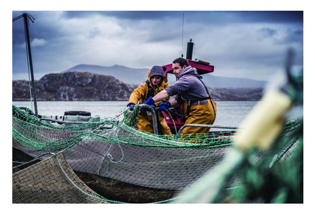
Analysis of trace chemical elements can reveal where farmed seafood comes from. Standardization of traceability tools and techniques is improving the process.

Getting food from the water to people's plates is a complex process prone to error and vulnerable to economic fraud. A 2021 Guardian Seascape meta-analysis of 44 studies found mislabeling in nearly 40 percent of 9,000 products from restaurants and markets. The United Kingdom and Canada ranked among the worst, with a mislabeling rate of 55 percent. Partly in response to these widespread issues, Oceana Canada (https://www.globalseafood.org/advocate/suppliers-retailers-and-others-call-forimproved-seafood-traceability-standards-in-canada/) along with other organizations prodded the federal government in March to implement a solution, something the authorities had promised to do.