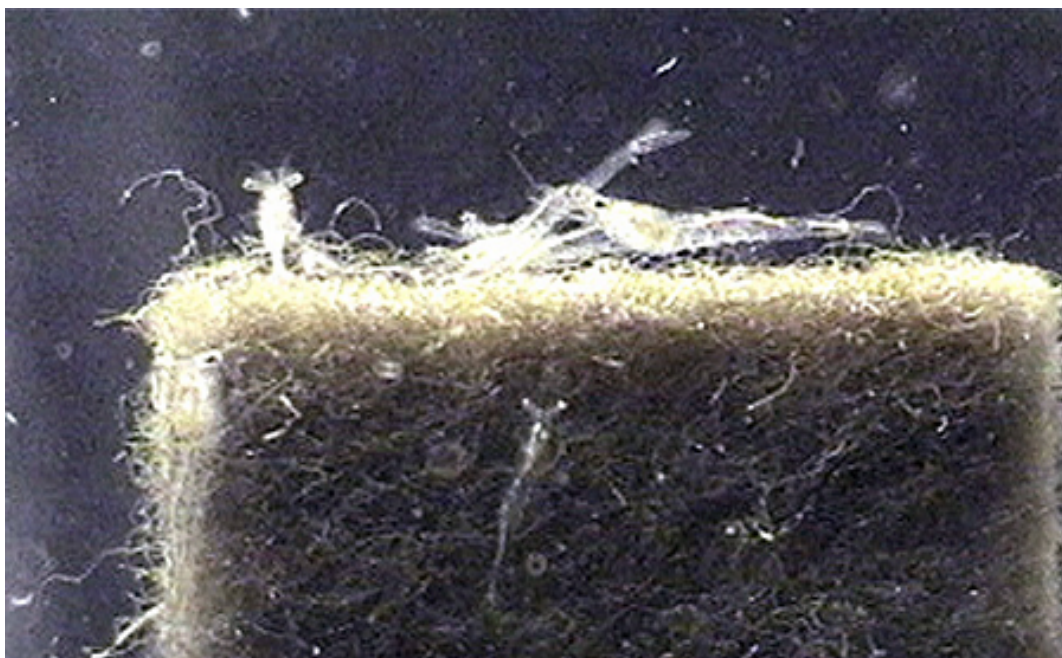
After metamorphosis, shrimp postlarvae show a preference for surface grazing.

Upon metamorphosis, P. vannamei postlarvae begin to exhibit a strong preference for surface grazing, as opposed to the more pelagic behavior associated with larval stages. Often the area provided by culture tank surfaces is not sufficient to support the benthic algae biomass required by the shrimp, and can be completely grazed within three days following metamorphosis.