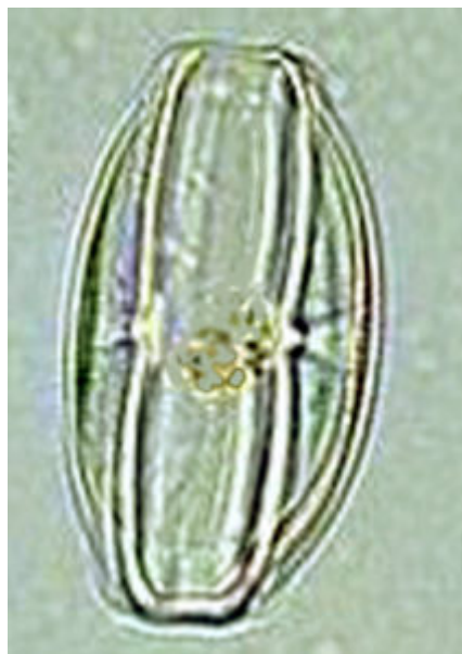
An Amphora diatom.