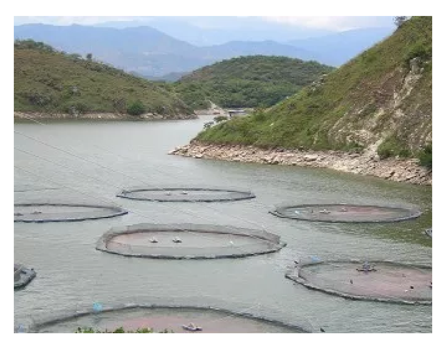
Tilapia in Colombia are grown using a variety of technologies, including round, surface cages like these.