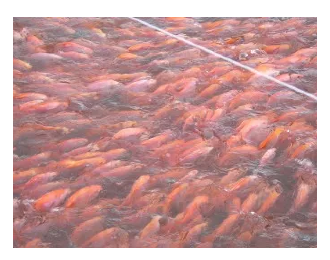
Tilapia, along with trout, currently are the main farmed species in Colombia.

Quality standards are voluntary ones adopted and implemented by agricultural producers worldwide, responding to a commercial requirement to remain in that market. In the case of Colombian aquaculture, the production of tilapia and trout constantly faces this requirement in its trade negotiations with the United States, Canada, the European Union and Peru. This is why FEDEACUA undertook the development of this comprehensive program to improve the competitiveness of its inland fish farming sector, through the implementation of a technology package.